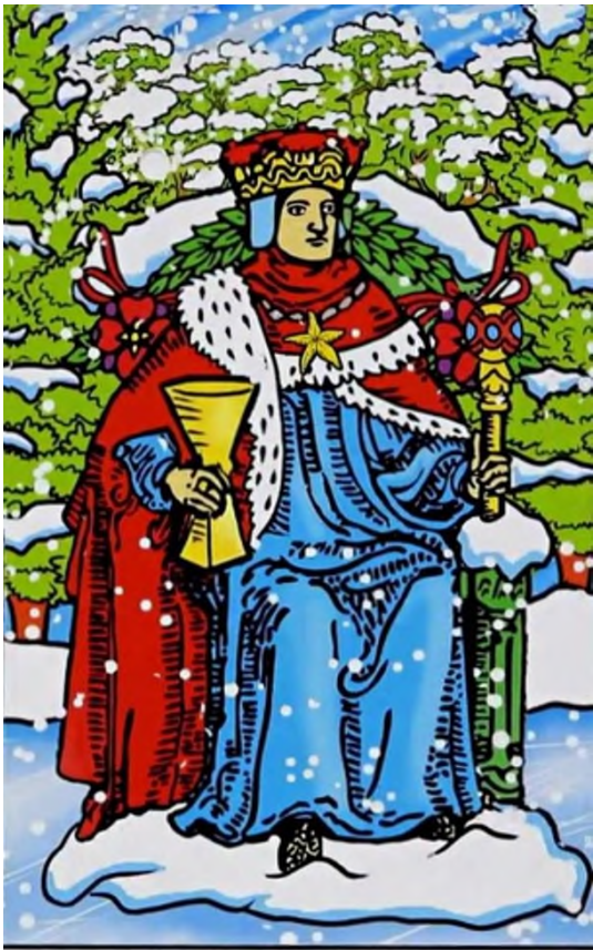
KING of CUPS.