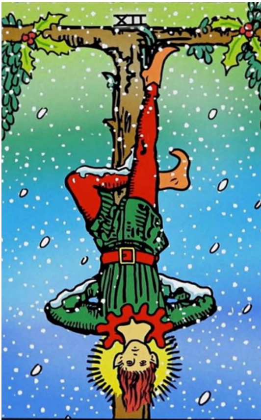
THE HANGED MAN.