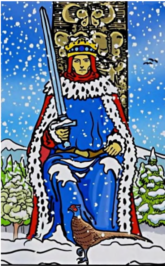
KING of SWORDS.