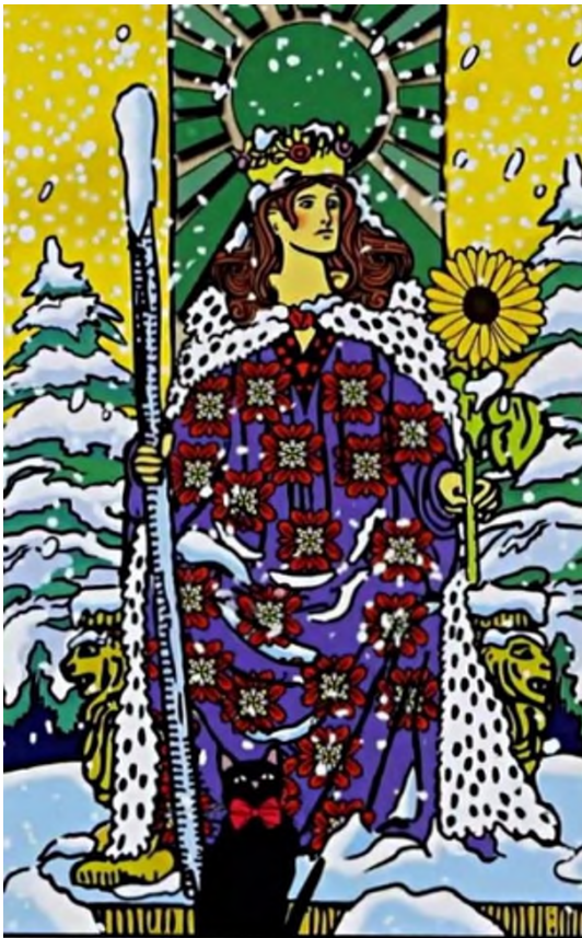
QUEEN of WANDS.