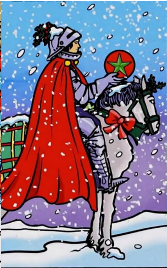
KNIGHT of PENTACLES.