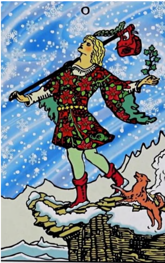
THE FOOL .