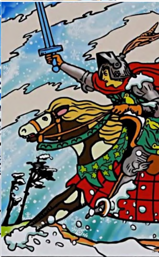
KNIGHT of SWORDS .