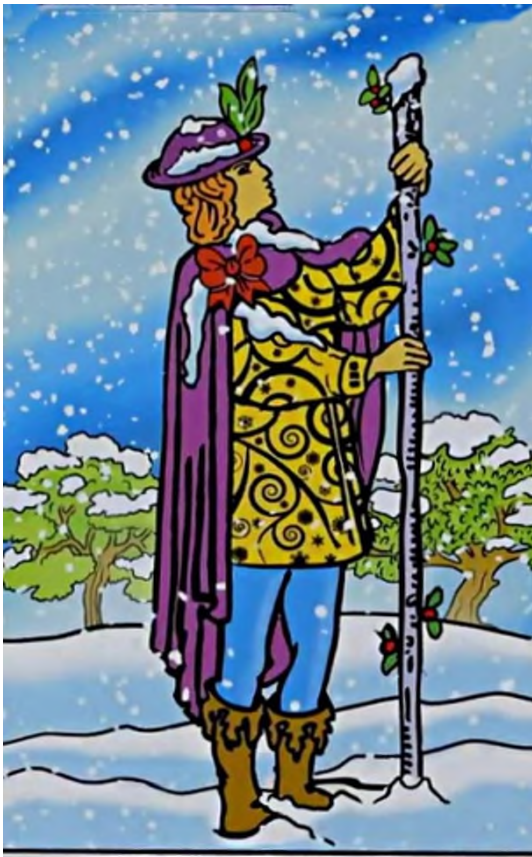
PAGE of WANDS.