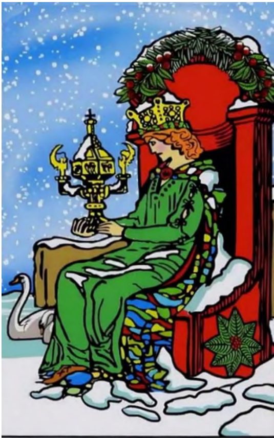
QUEEN of CUPS.