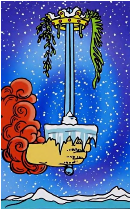
ACE of SWORDS.