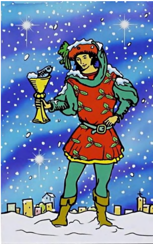
PAGE of CUPS.