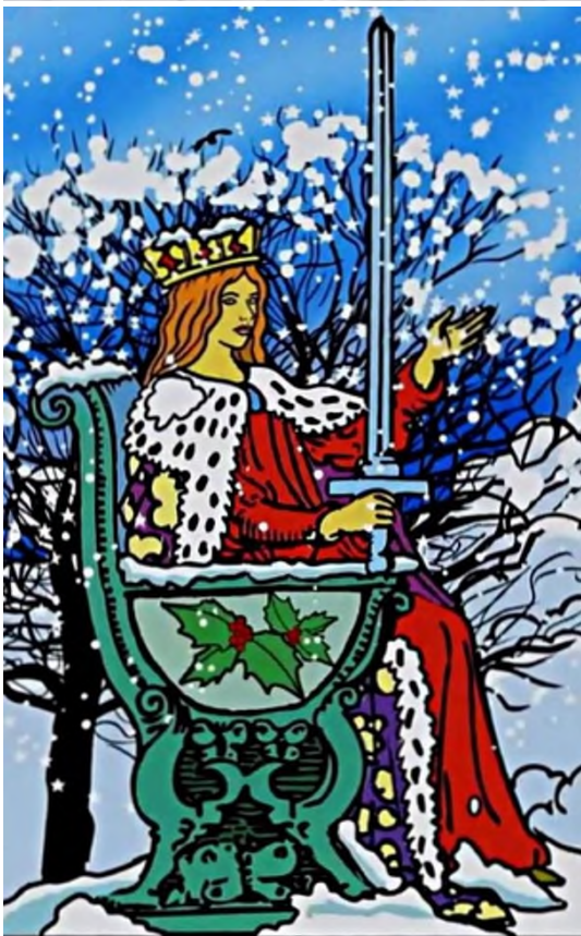
QUEEN of SWORDS.