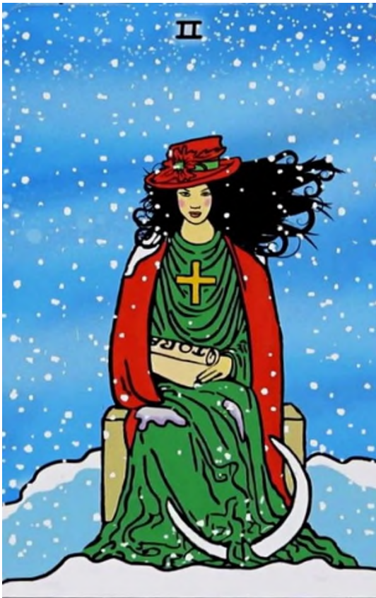
THE HIGH PRIESTESS