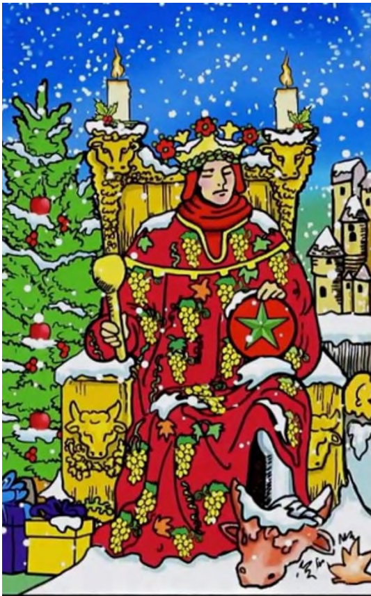
KING of PENTACLES.