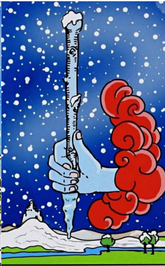
ACE of WANDS.