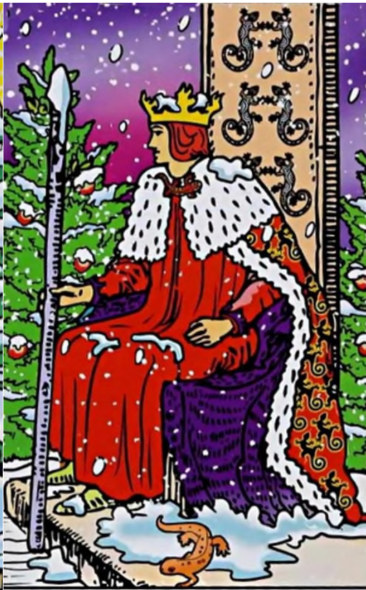
KING of WANDS