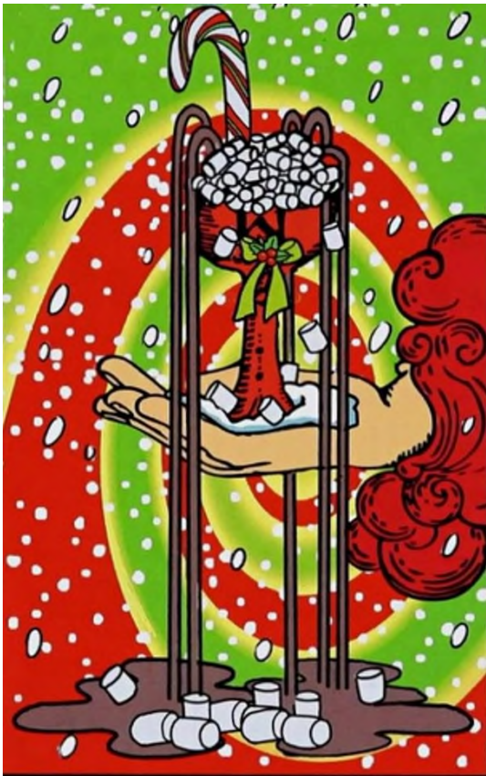
ACE of CUPS.