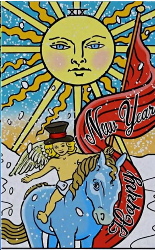
THE SUN .