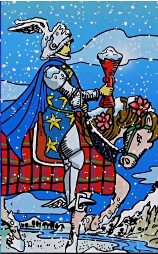
KNIGHT of CUPS.