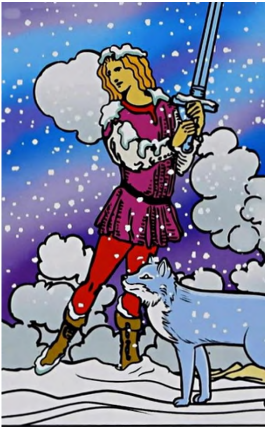
PAGE of SWORDS.