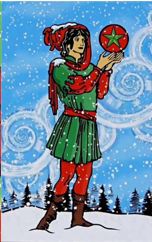
PAGE of PENTACLES.