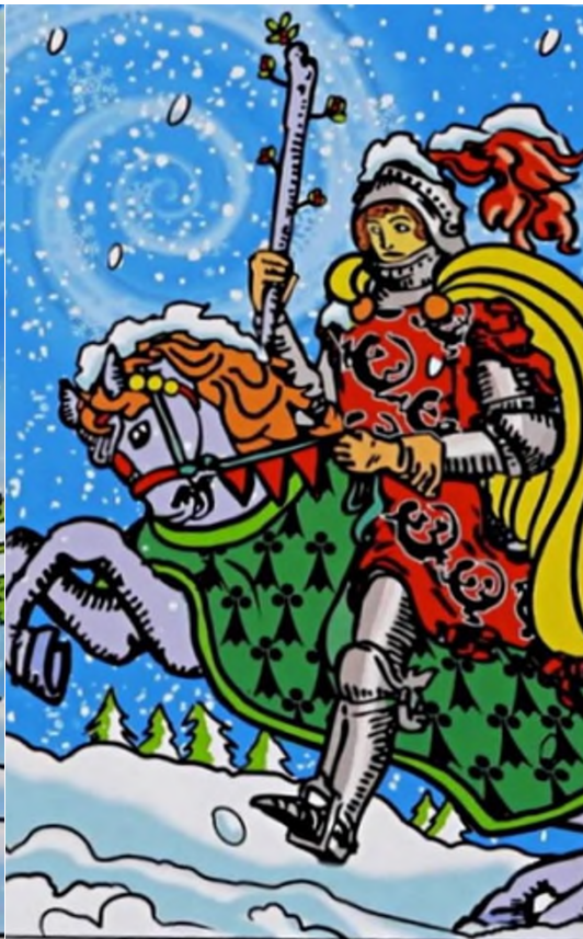
KNIGHT of WANDS.