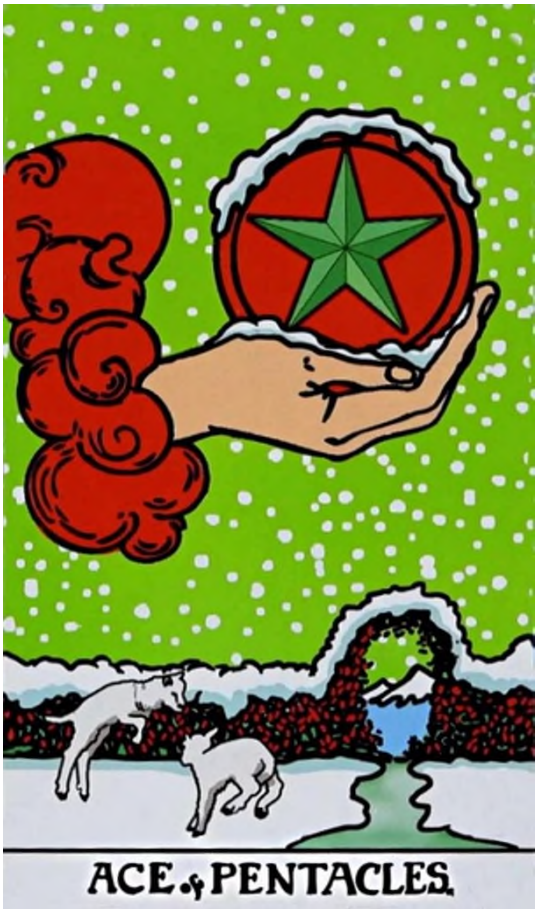
ACE & PENTACLES