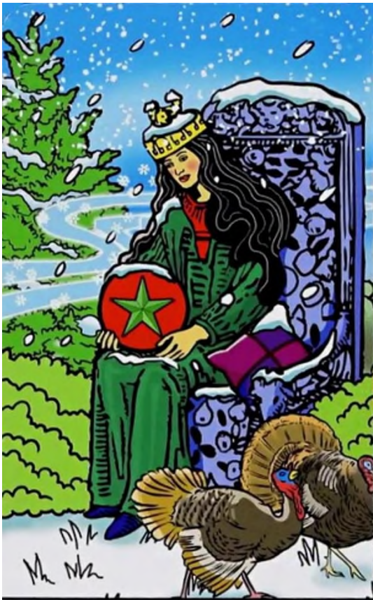
QUEEN of PENTACLES