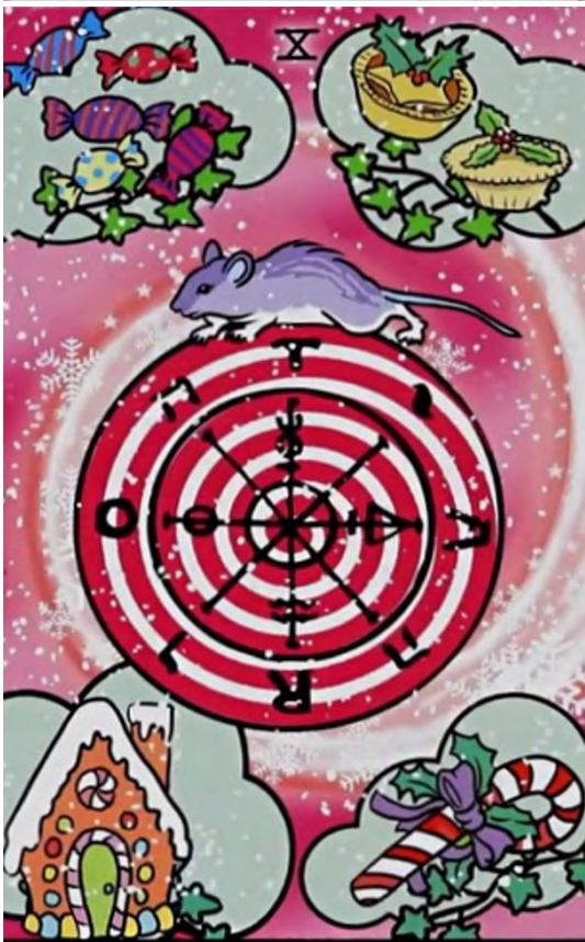
WHEEL OF FORTUNE.