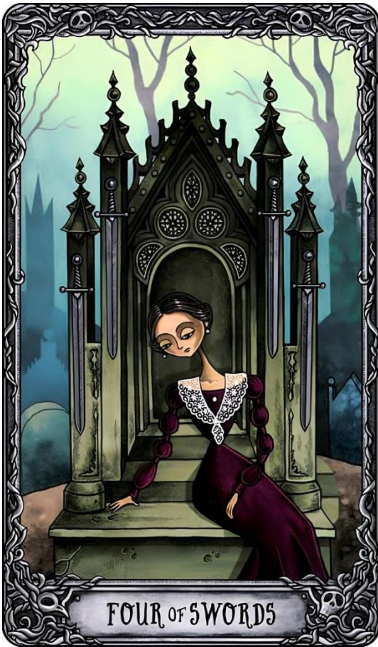
FOUR OF SWORDS