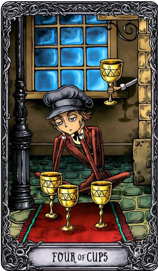
FOUR OF CUPS