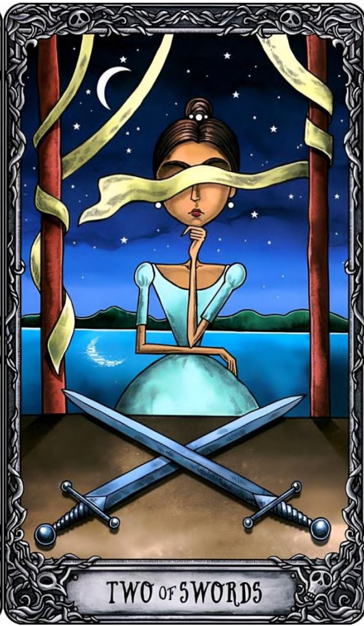
TWO OF SWORDS