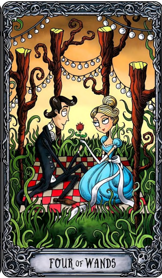
FOUR OF WANDS