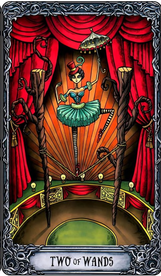
TWO OF WANDS