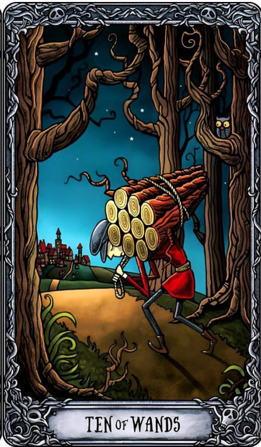
TEN OF WANDS