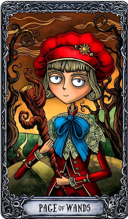
PAGE OF WANDS