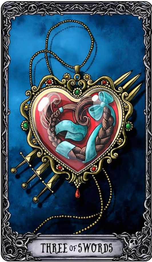
THREE OF SWORDS