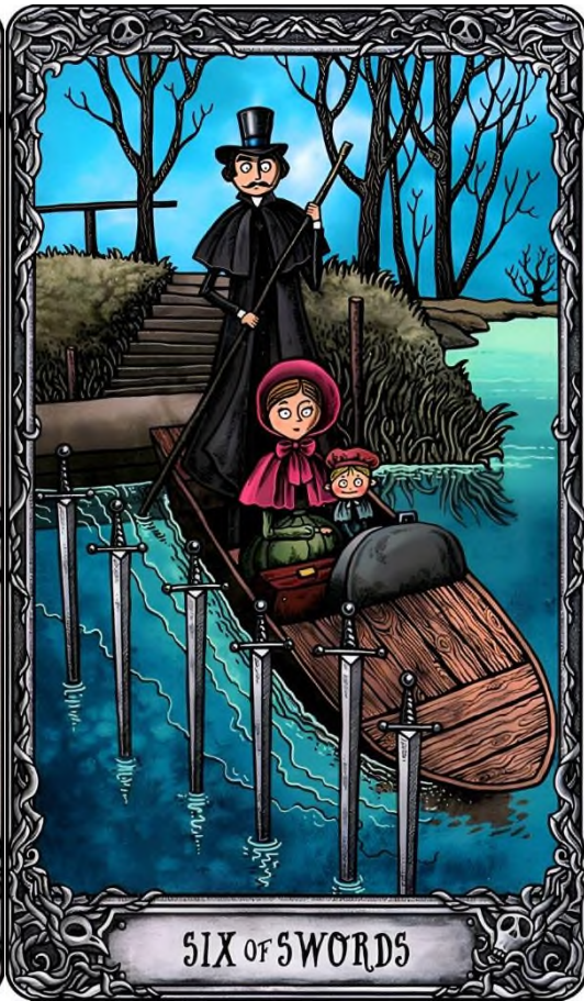
SIX OF SWORDS