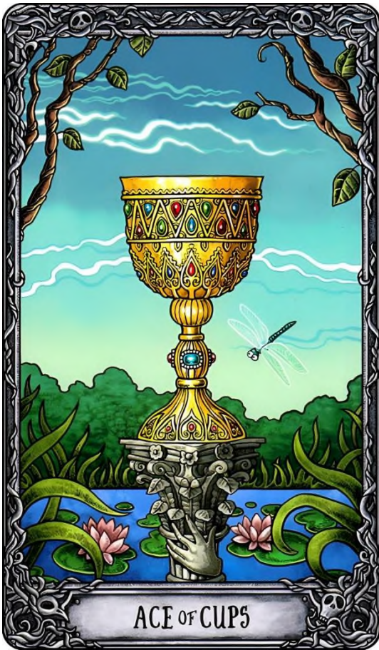
ACE OF CUPS