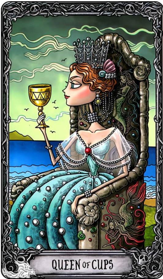
QUEEN OF CUPS