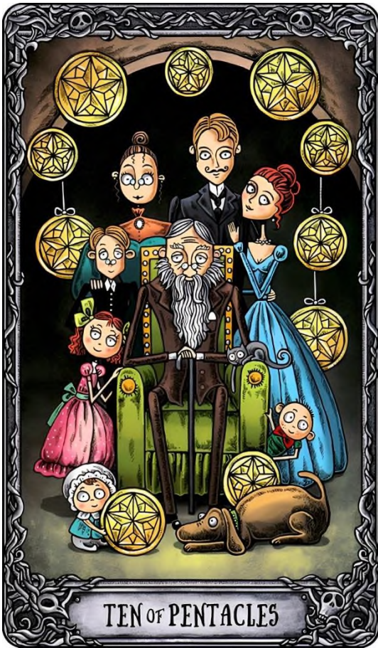
TEN OF PENTACLES