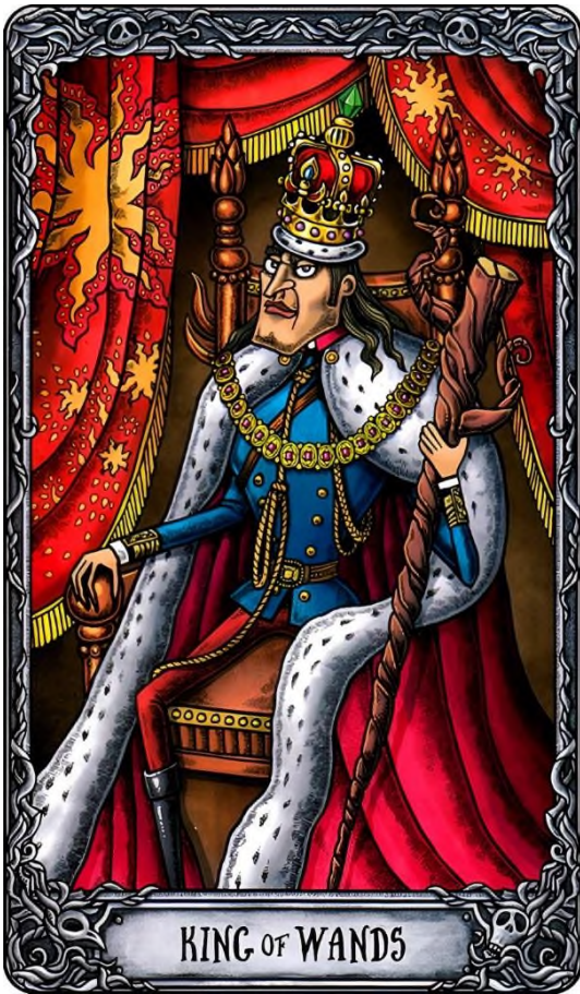
KING OF WANDS