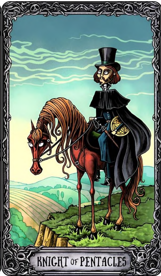
KNIGHT OF PENTACLES