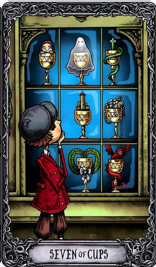
SEVEN OF CUPS