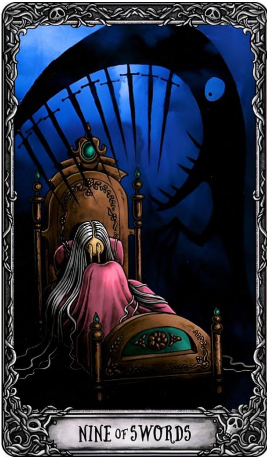
NINE OF SWORDS