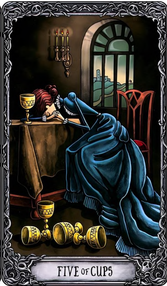
FIVE OF CUPS