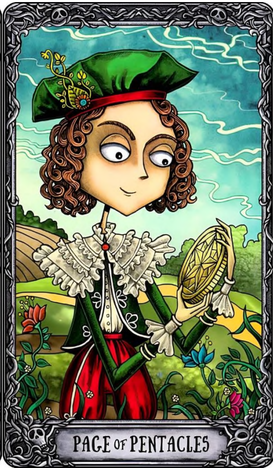
PAGE OF PENTACLES