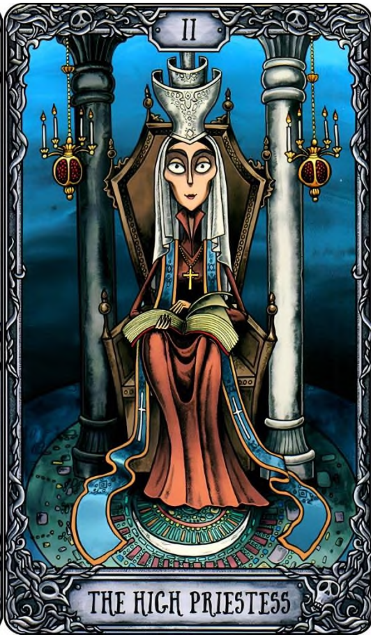
THE HIGH PRIESTESS