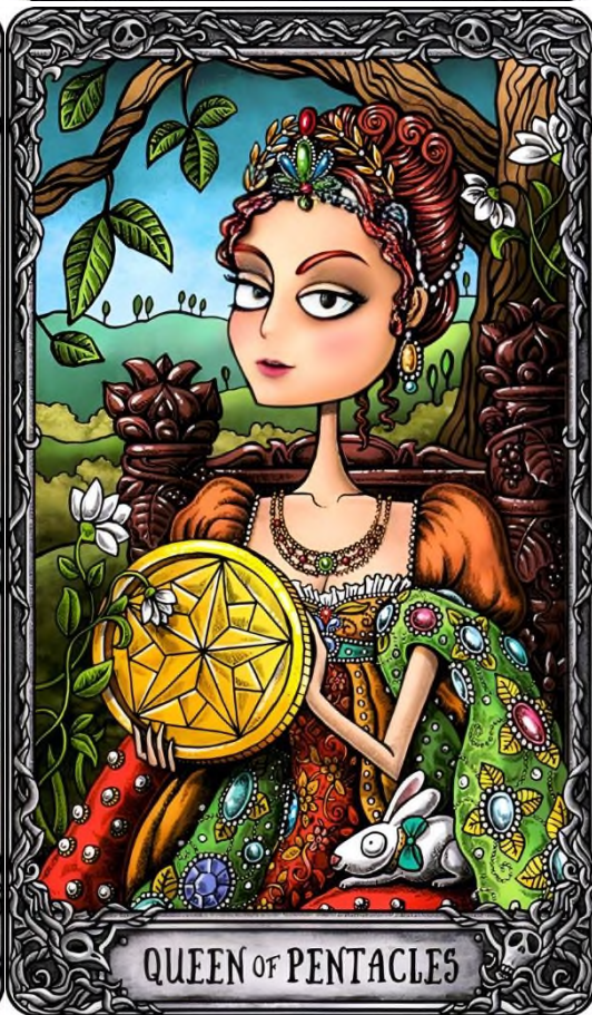
QUEEN OF PENTACLES