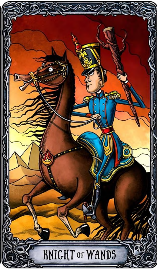
KNIGHT OF WANDS