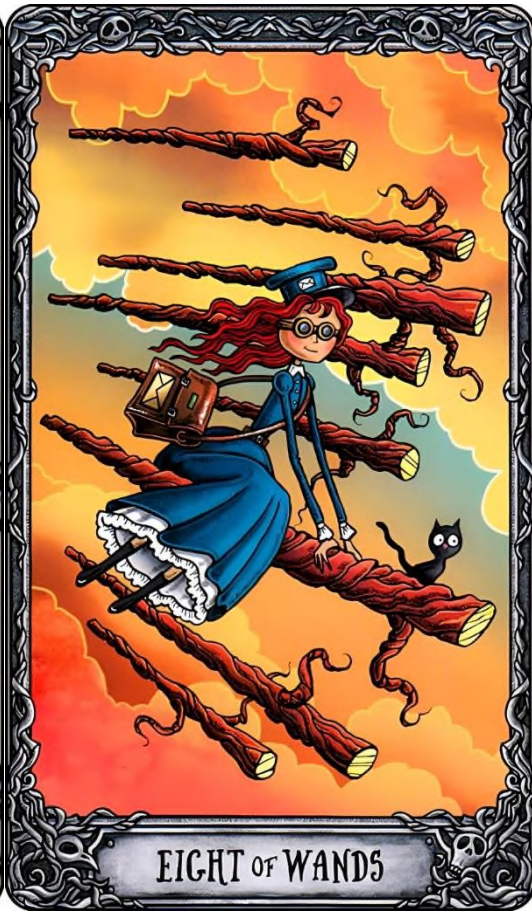
EIGHT OF WANDS