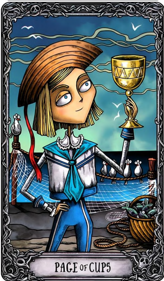
PAGE OF CUPS