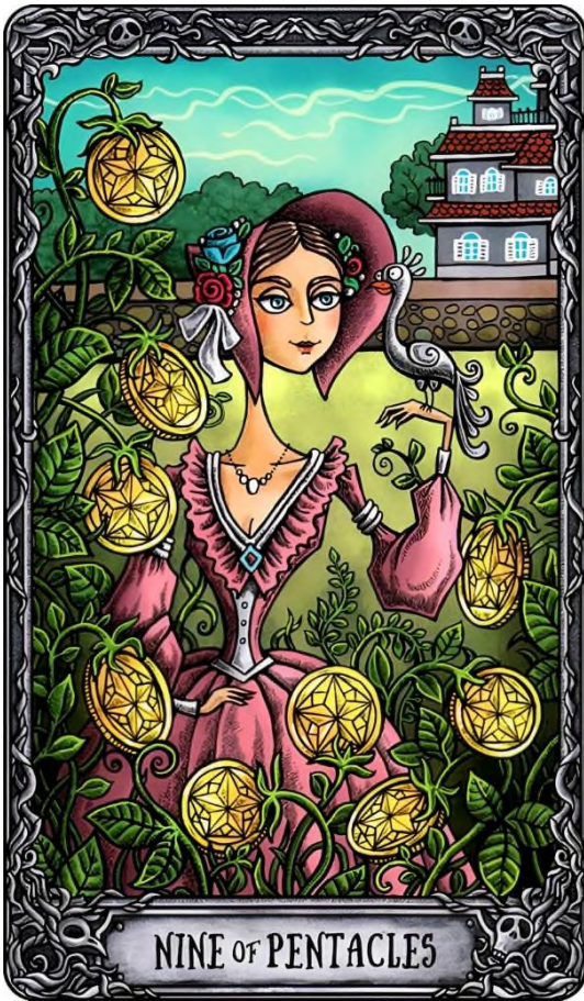
NINE OF PENTACLES