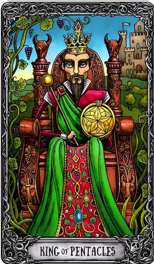
KING OF PENTACLES