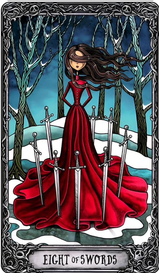
EIGHT OF SWORDS