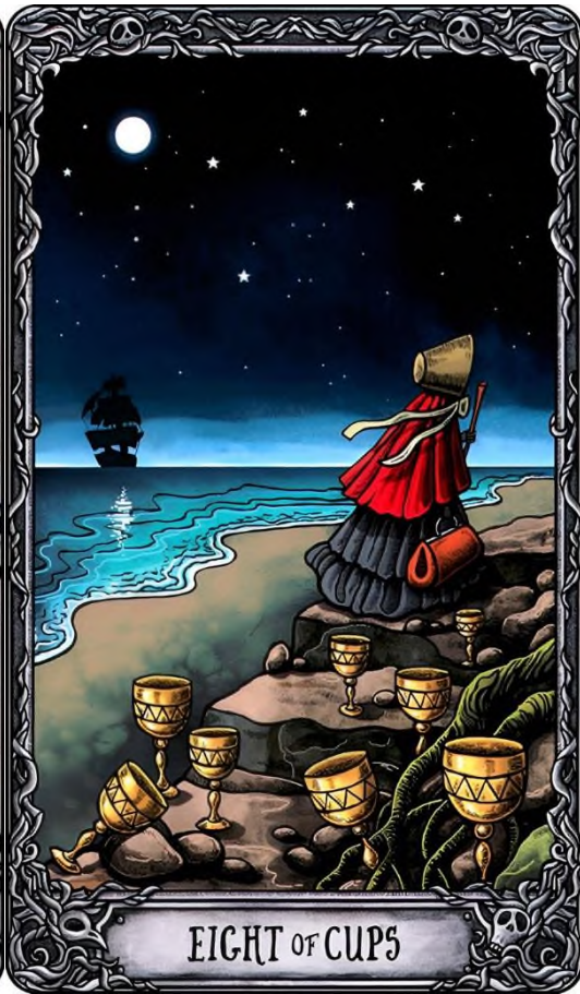
EIGHT OF CUPS