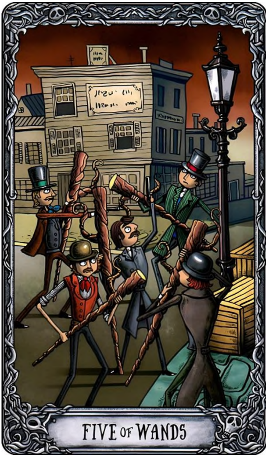
FIVE OF WANDS