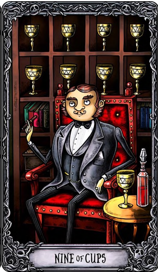
NINE OF CUPS