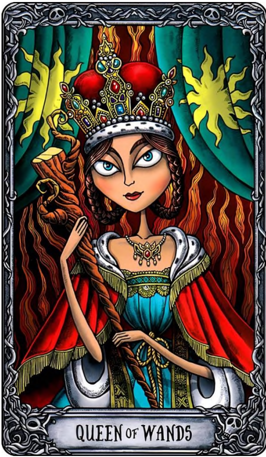
QUEEN OF WANDS