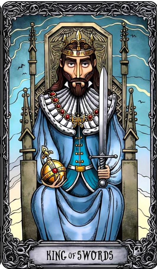
KING OF SWORDS