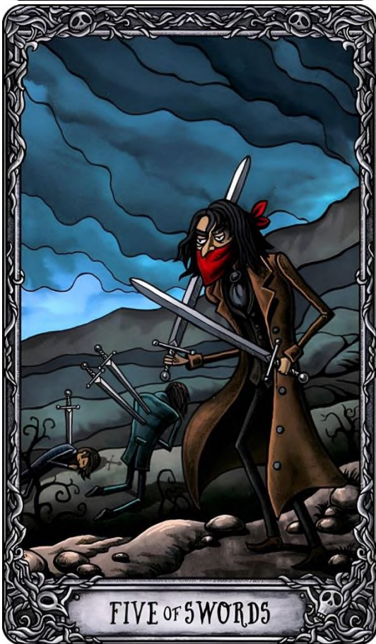
FIVE OF SWORDS