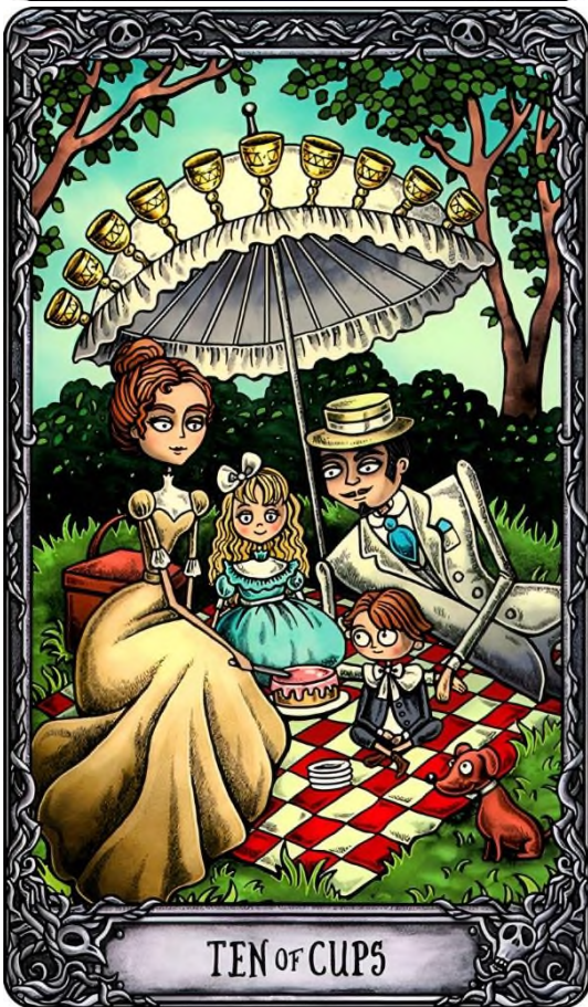
TEN OF CUPS