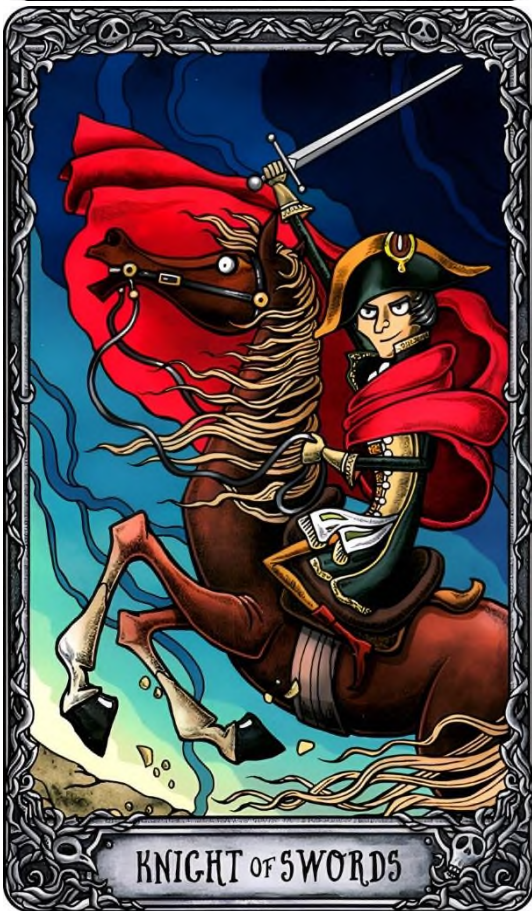
KNIGHT OF SWORDS