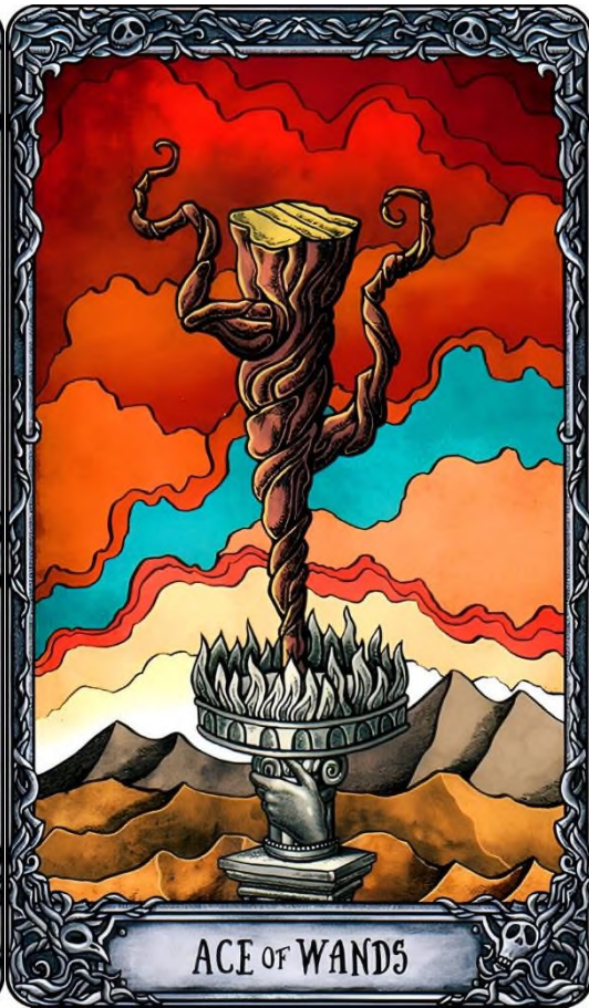
ACE OF WANDS