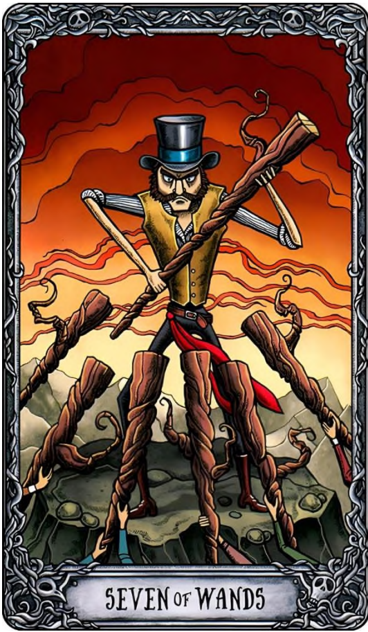
SEVEN OF WANDS