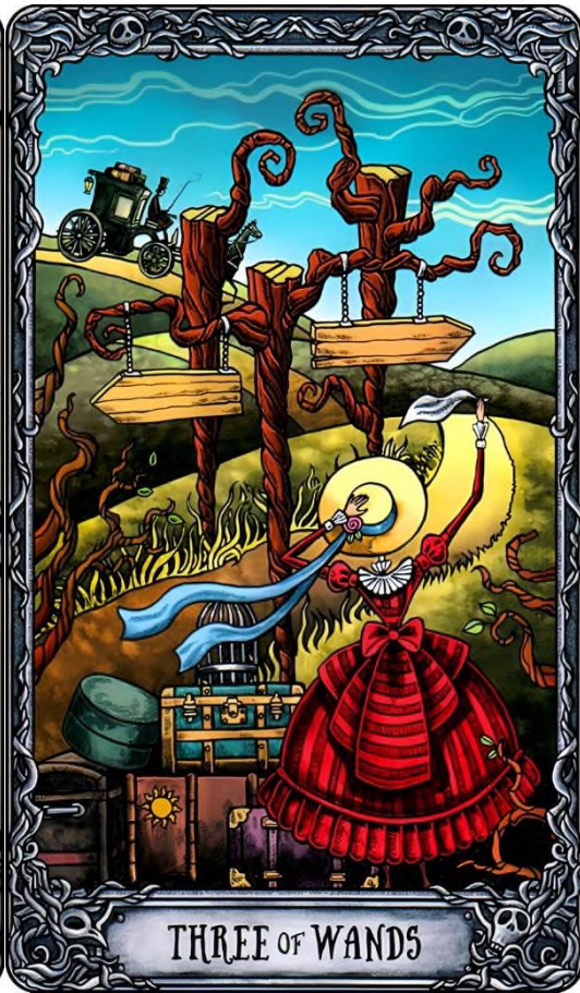
THREE OF WANDS