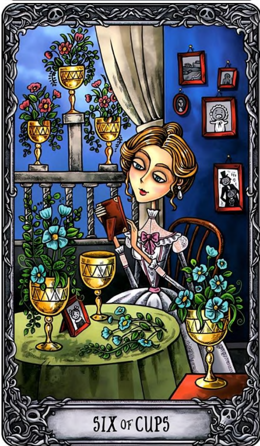
SIX OF CUPS