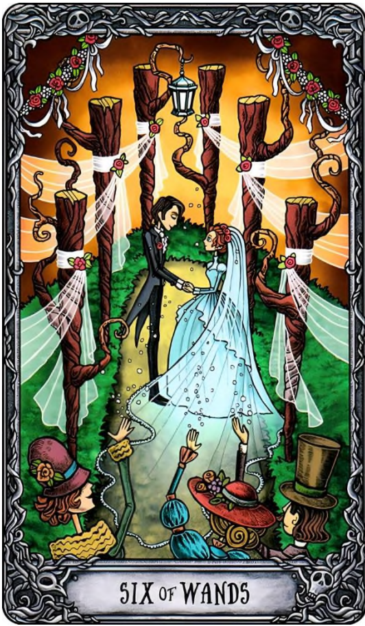
SIX OF WANDS