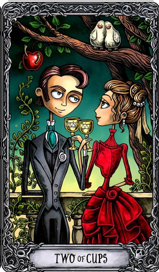
TWO OF CUPS