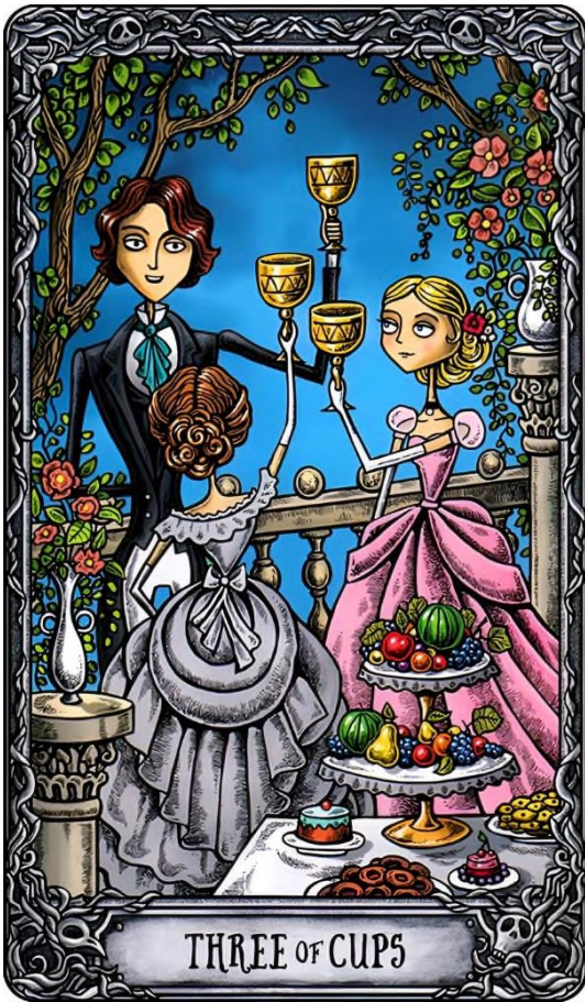
THREE OF CUPS