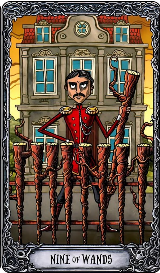
NINE OF WANDS