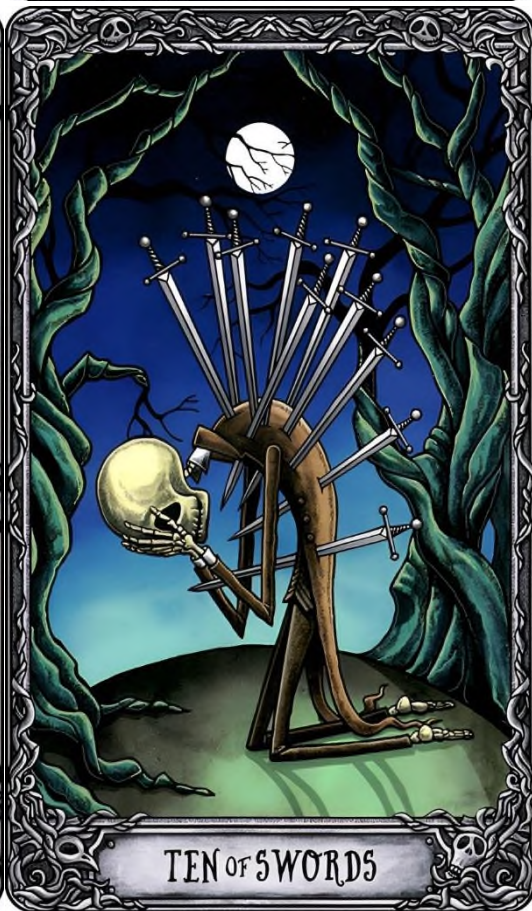
TEN OF SWORDS