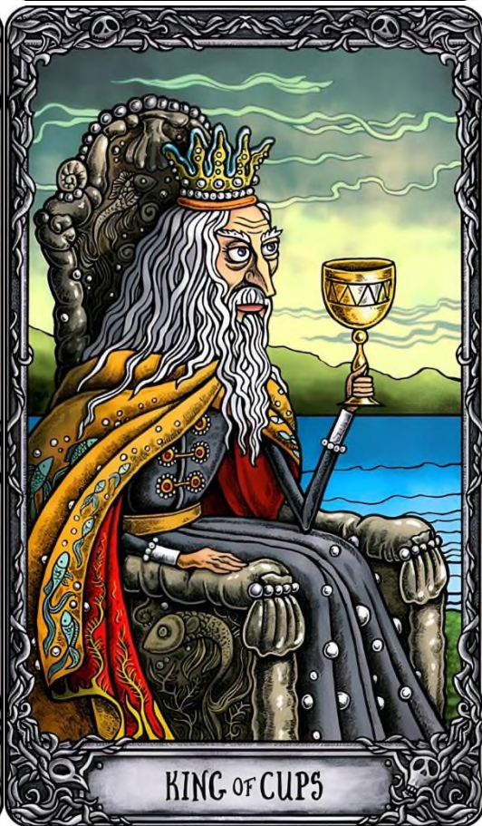
KING OF CUPS