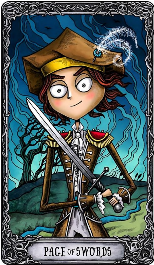
PAGE OF SWORDS