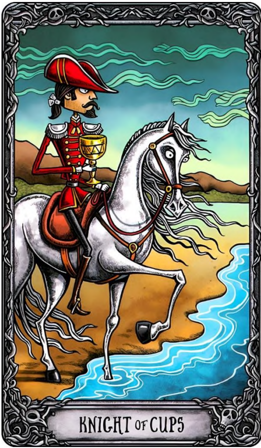
KNIGHT OF CUPS