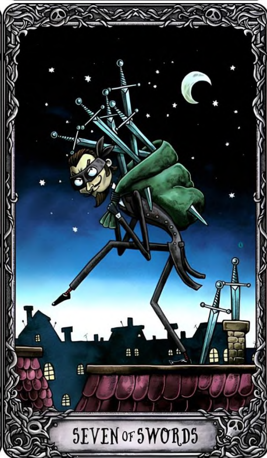
SEVEN OF SWORDS