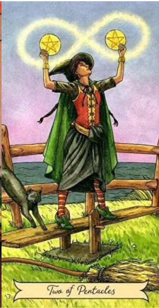
Two of Pentacles