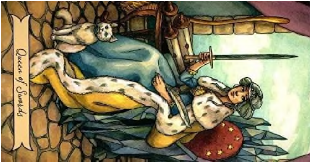
Queen of Swords