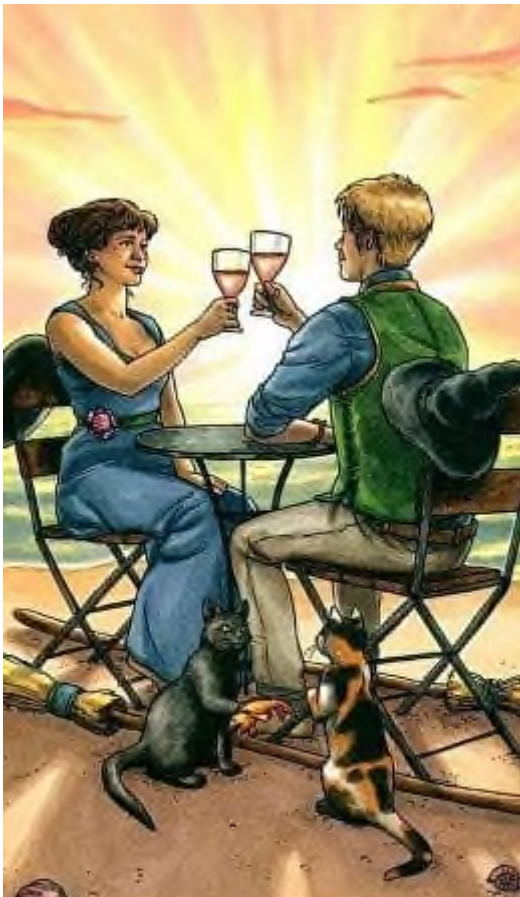
Two of Cups