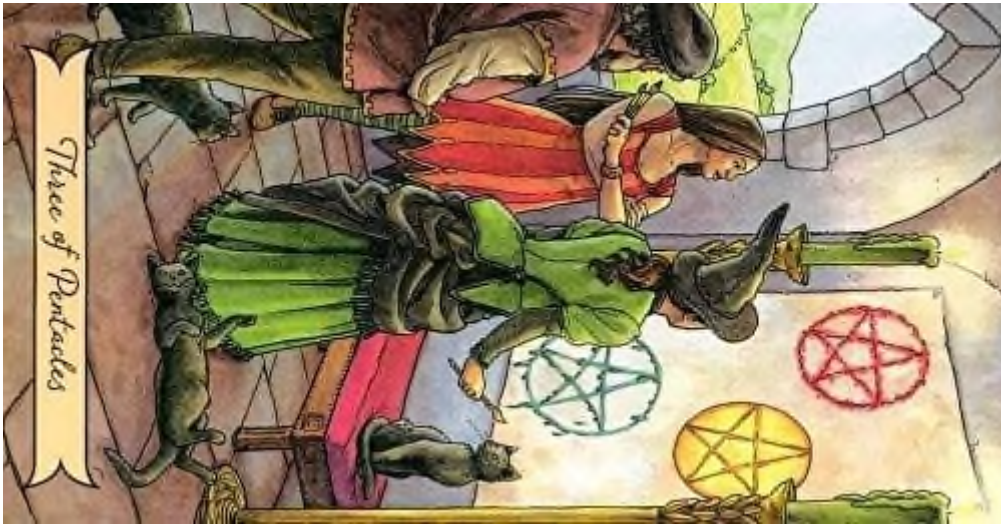
Three of Pentacles