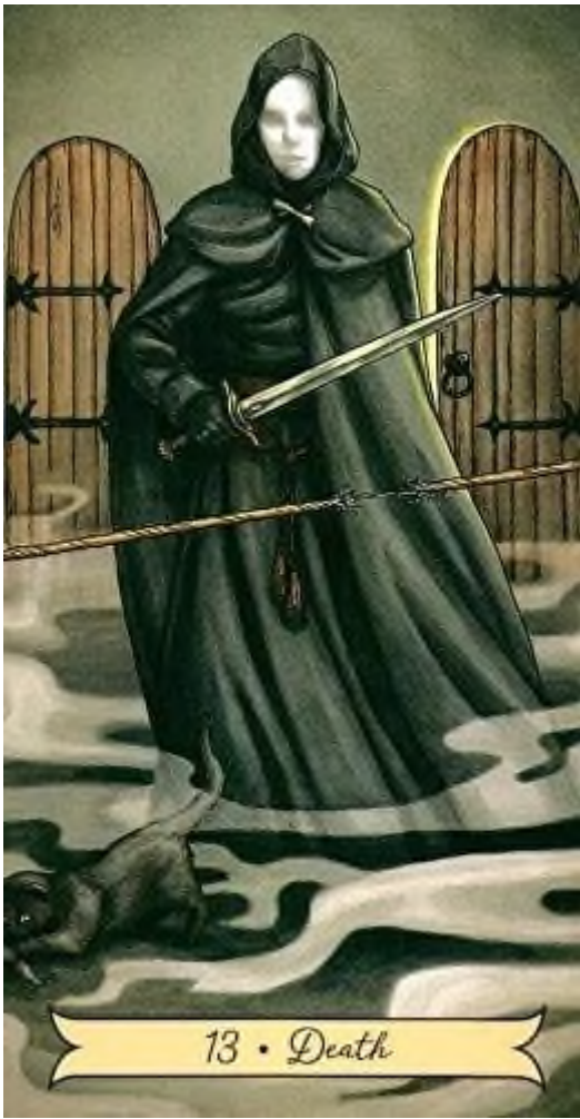
13 • Death