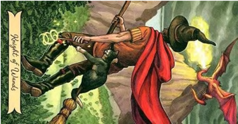
Riight of Wands