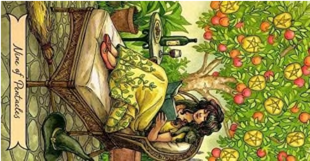
Nine of Pentacles