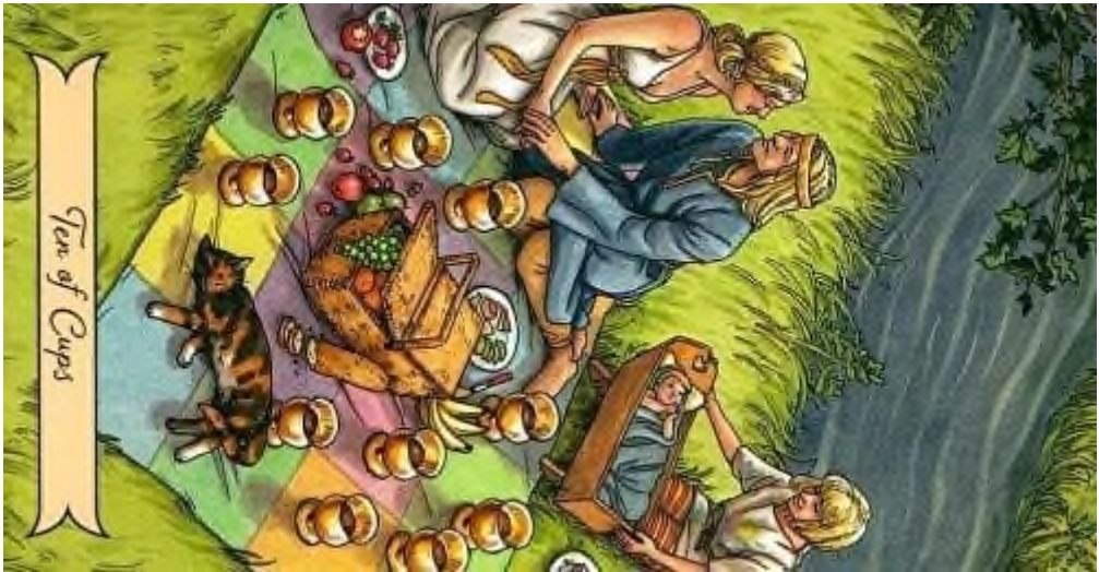
Ten of Cups