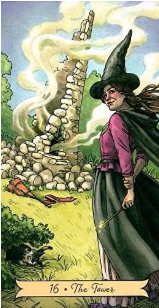
16 • The Tower