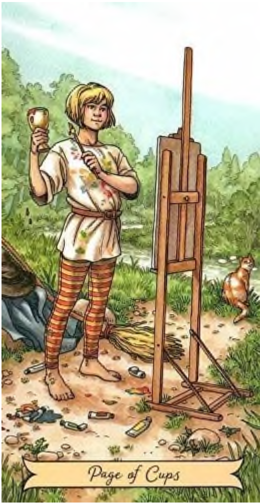
Page of Cups