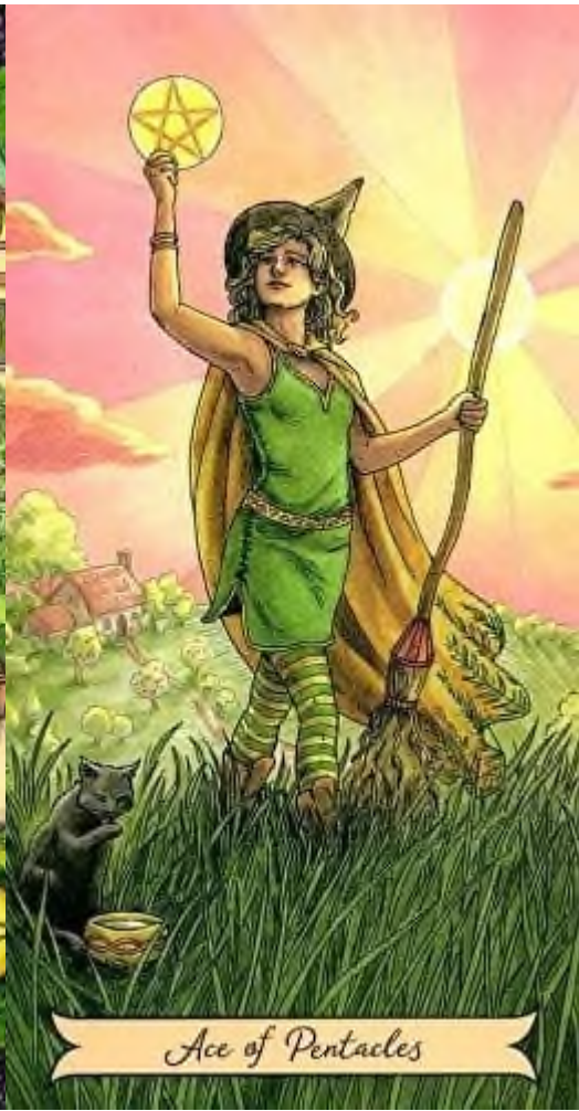
Ace of Pentacles