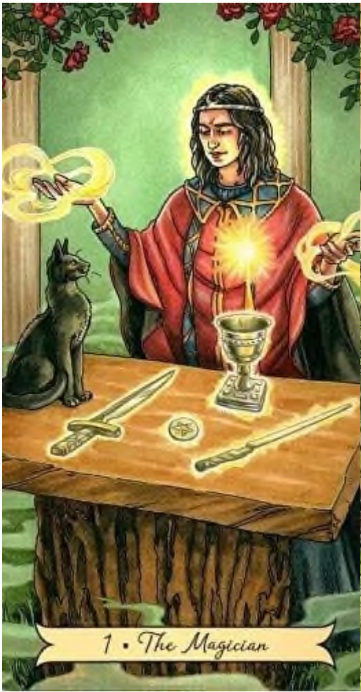
1 • The Magician