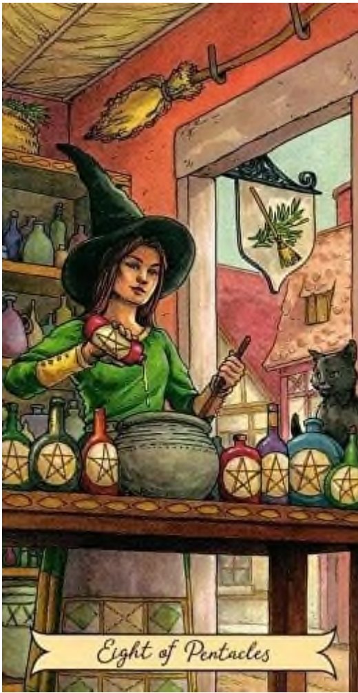
Eight of Pentacles