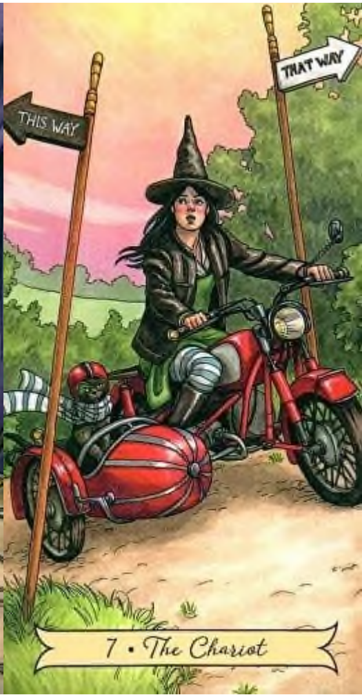
7 • The Chariot