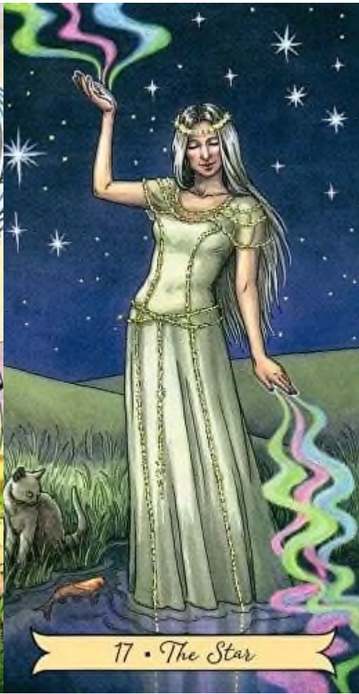
17 • The Star