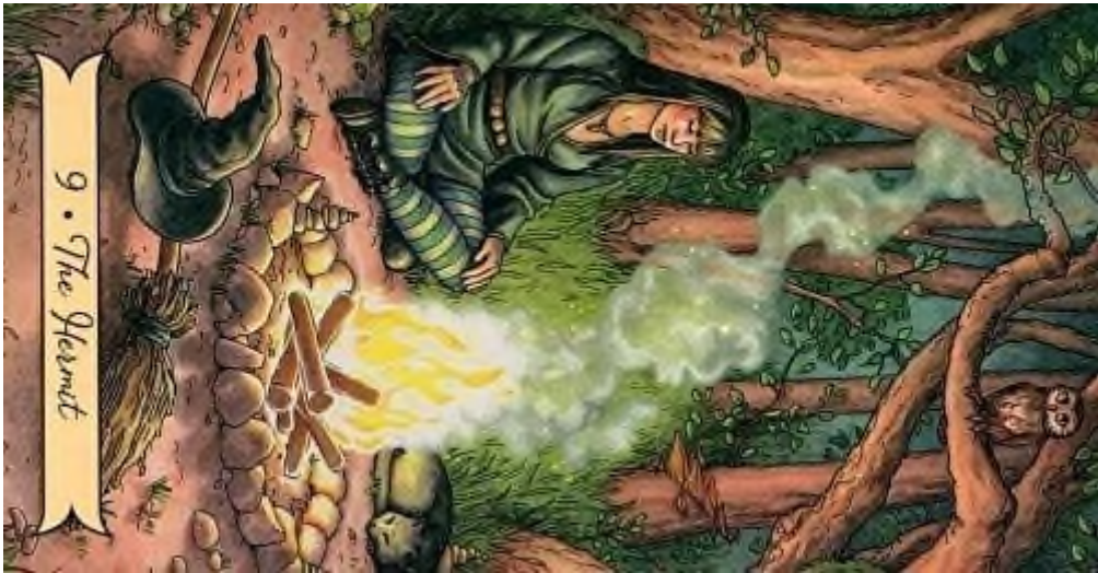
9 • The Hermit