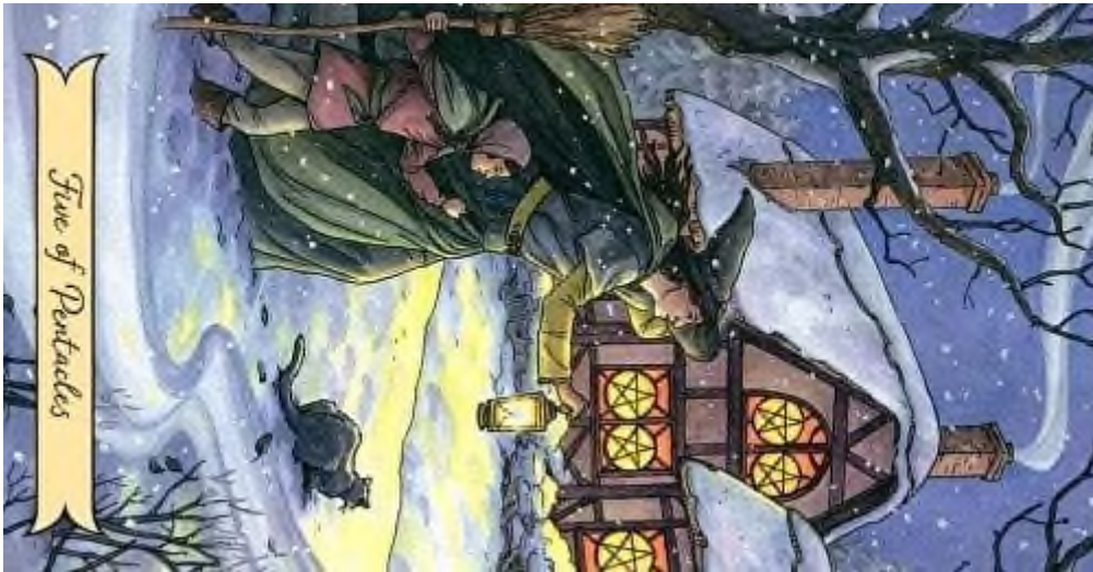
Five of Pentacles