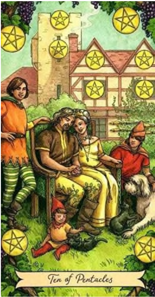
Ten of Pentacles