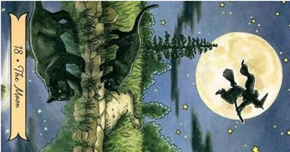
18 • The Moon