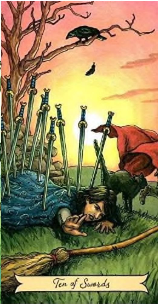
Ten of Swords