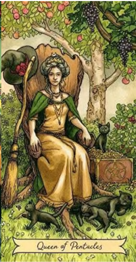
Queen of Pentacles