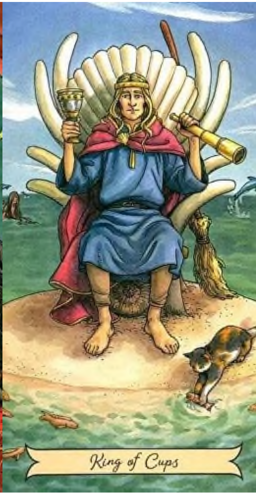
King of Cups