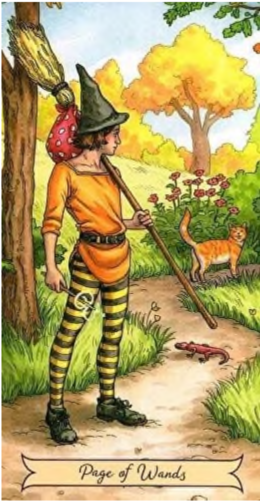
Page of Wands