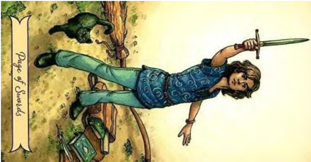
Page of Swords