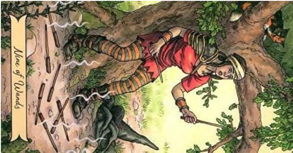
Nine of Wands