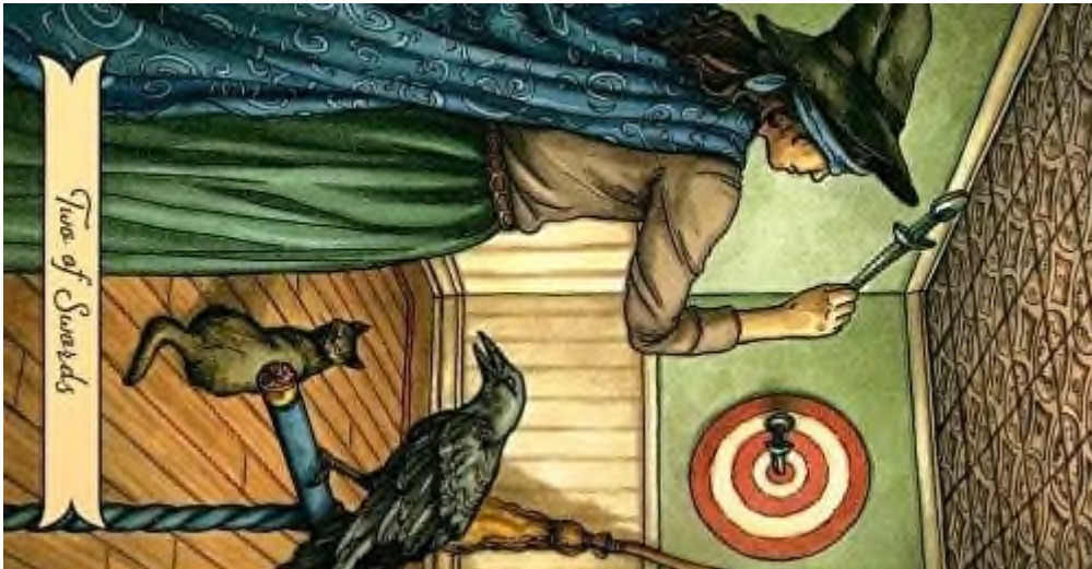
Two of Swords