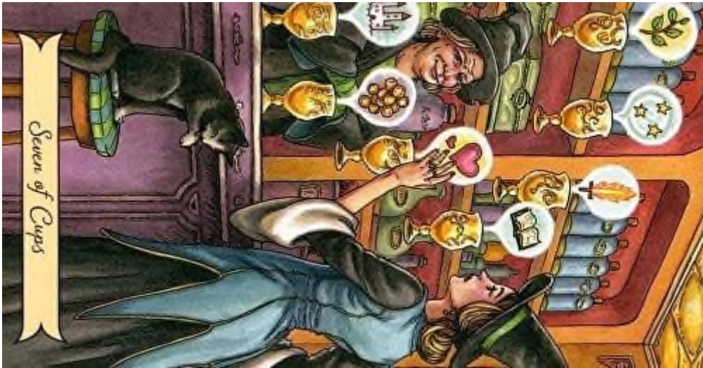
Seven of Cups