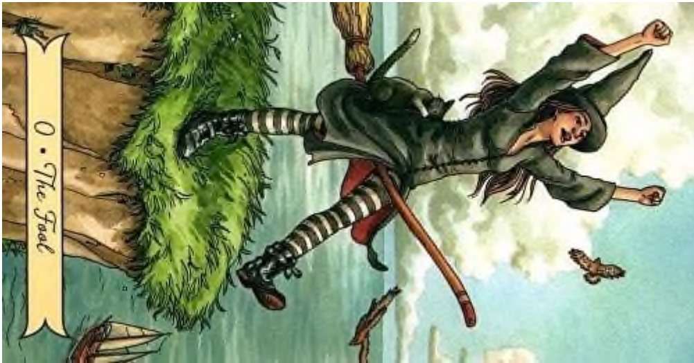
0 • The Fool