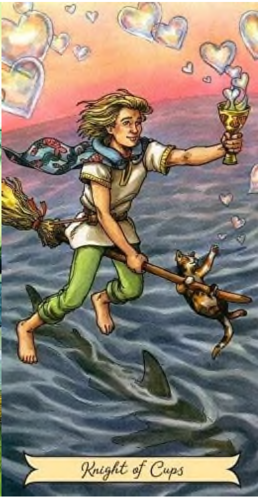
Knight of Cups