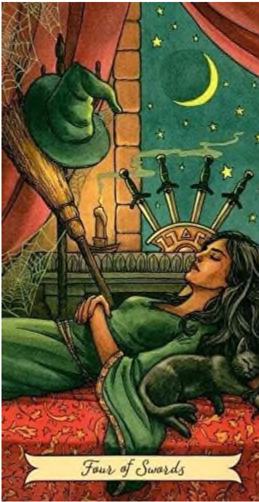
Four of Swords