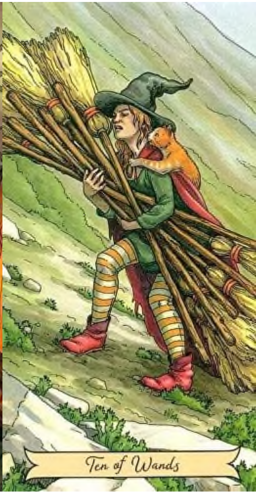
Ten of Wands