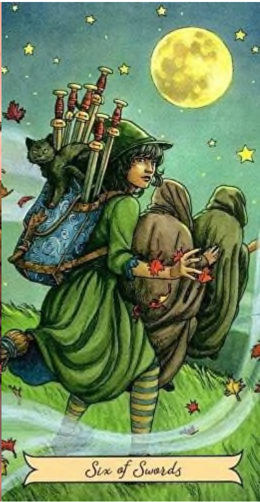
Six of Swords