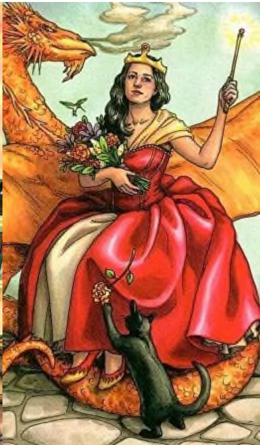
Queen of Wands