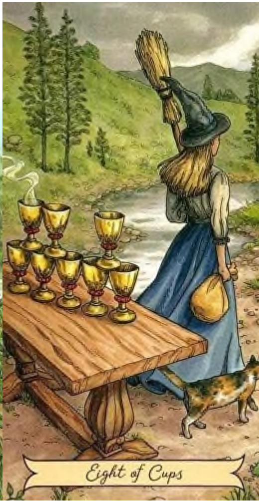
Eight of Cups