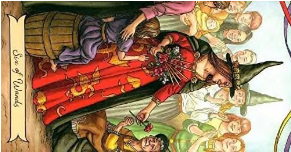
Six of Wands