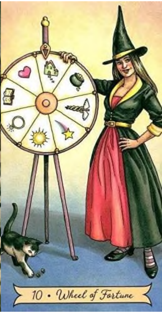
10 • Wheel of Fortune