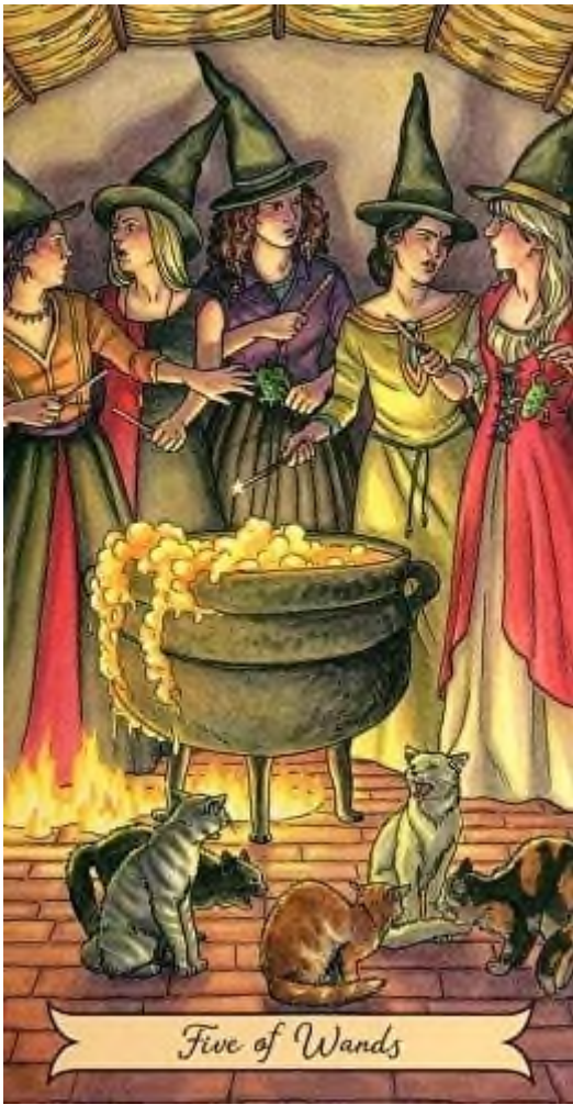
Five of Wands