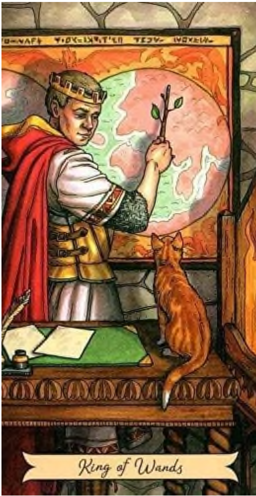
King of Wands