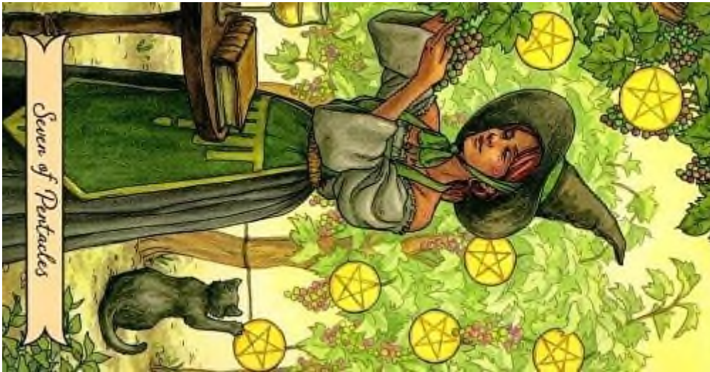
Seven of Pentacles