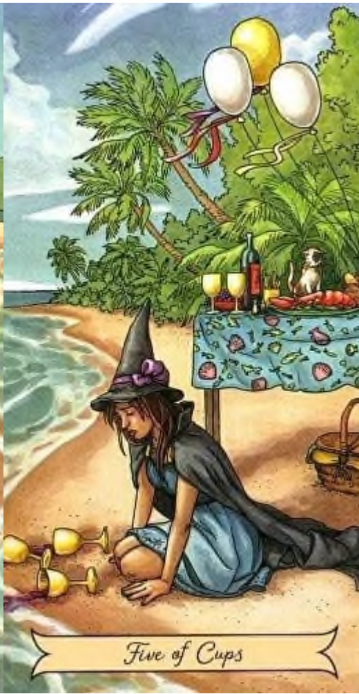
Five of Cups