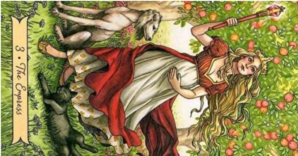
3 • The Empress