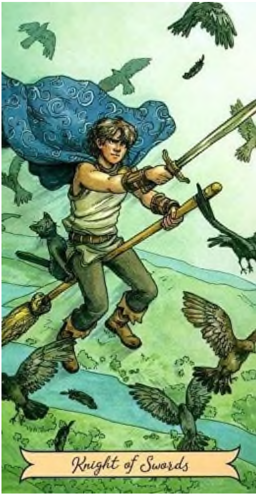
Knight of Swords