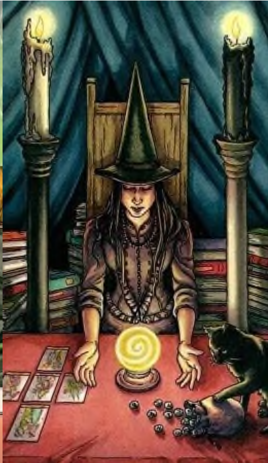
2 • The High Priestess