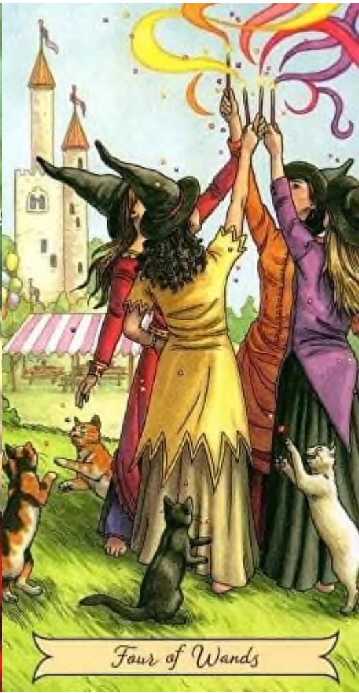
Four of Wands