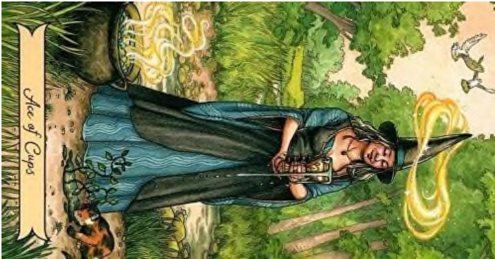
Ace of Cups