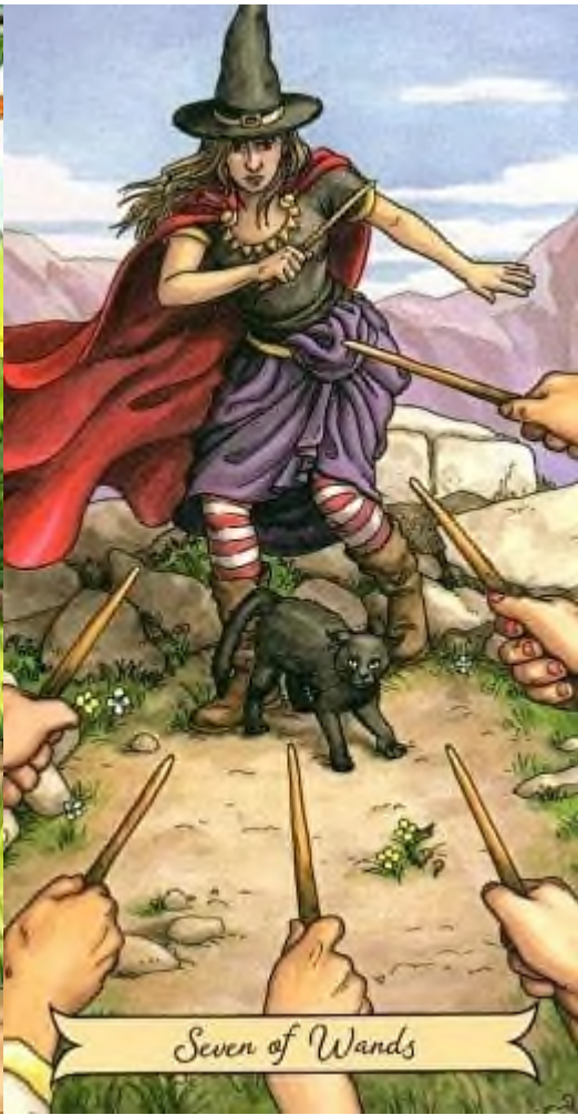
Seven of Wands