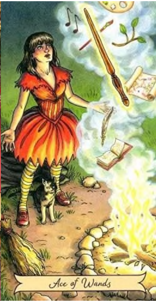
Ace of Wands