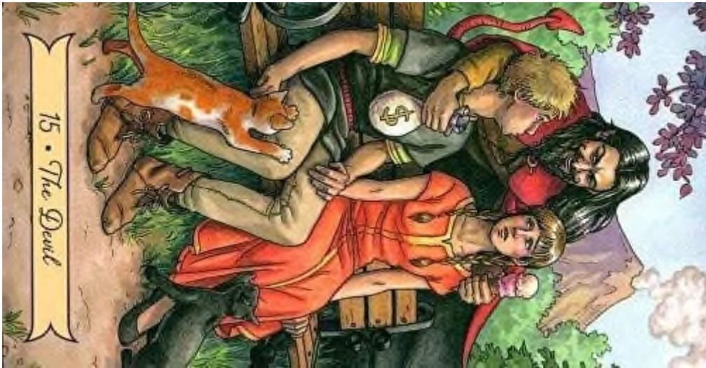
15 • The Devil