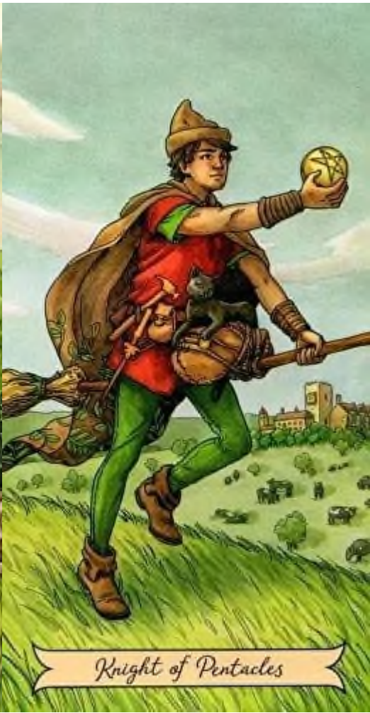
Knight of Pentacles