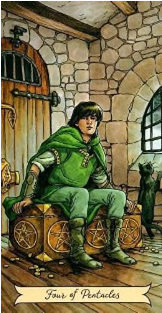
Four of Pentacles