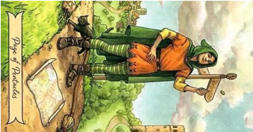
Page of Pentacles