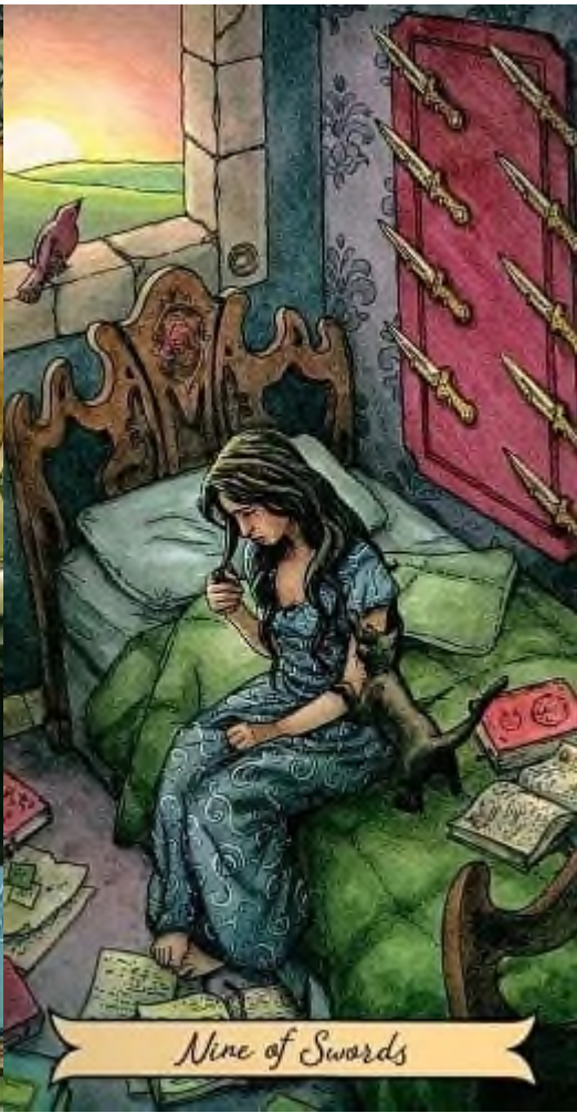
Nine of Swords