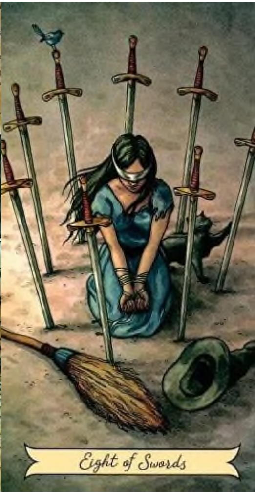
Eight of Swords