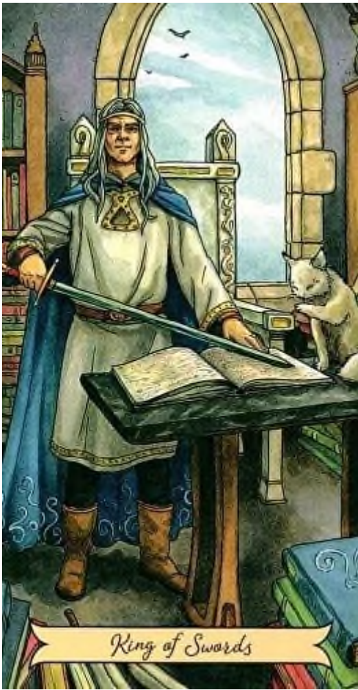
King of Swords