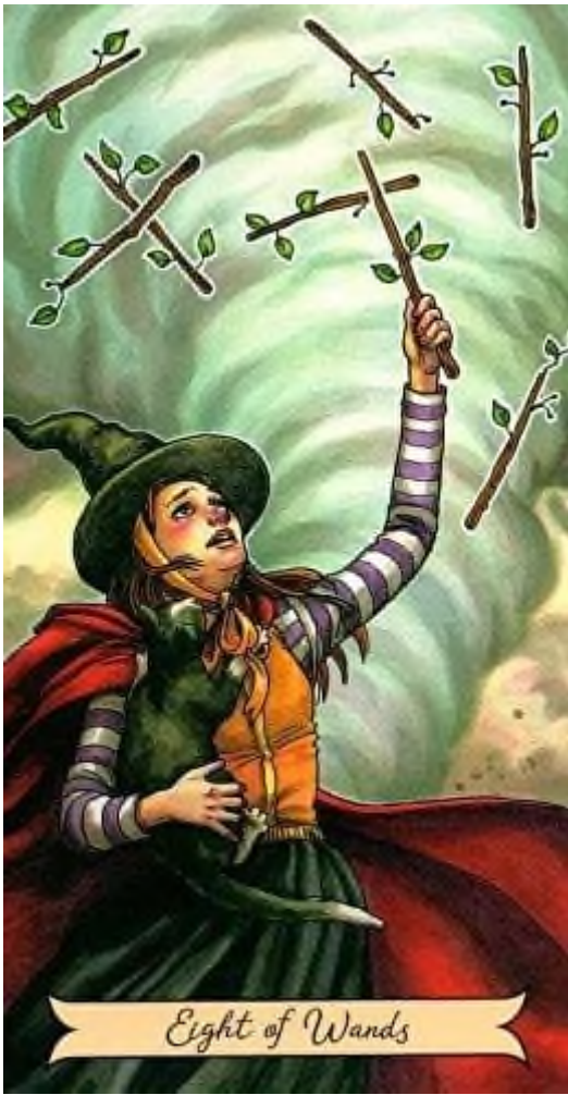
Eight of Wands