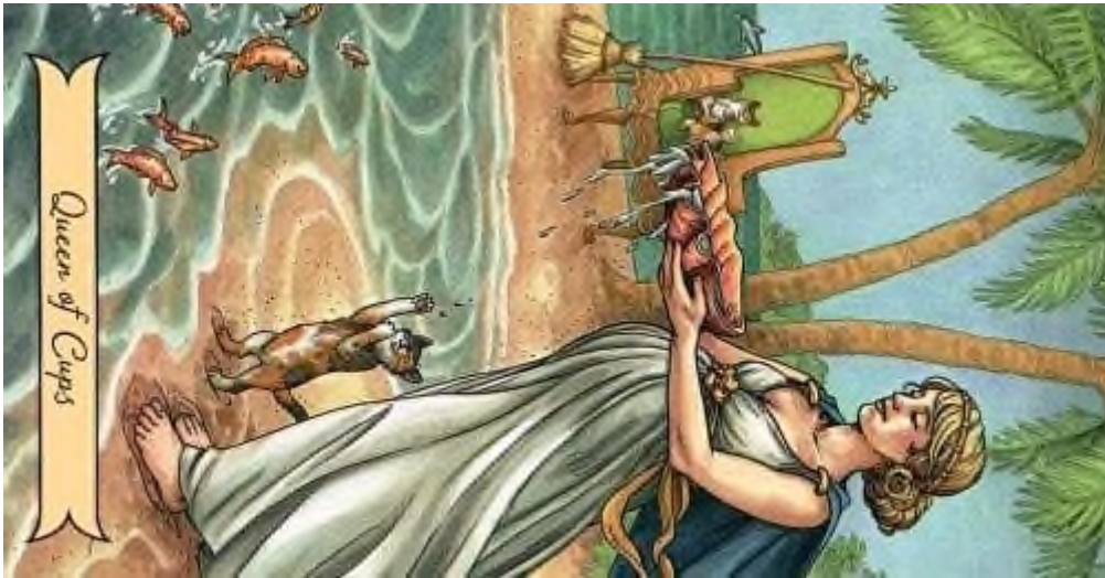
Queen of Cups