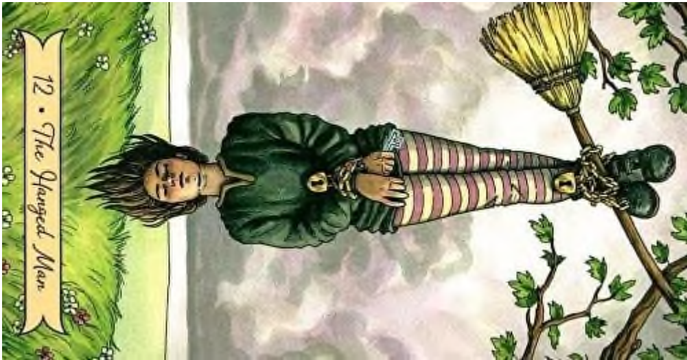
12 • The Hanged Man