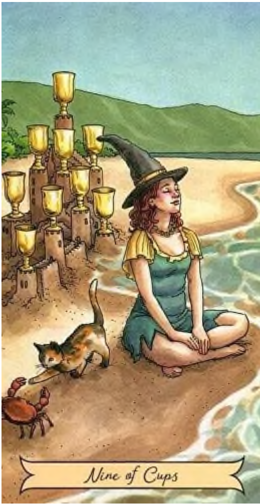
Nine of Cups