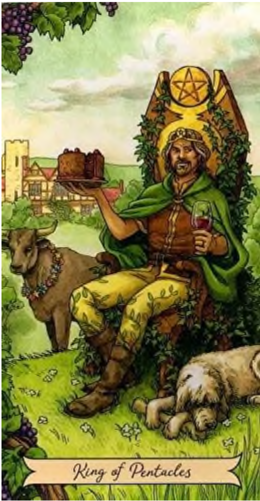
King of Pentacles