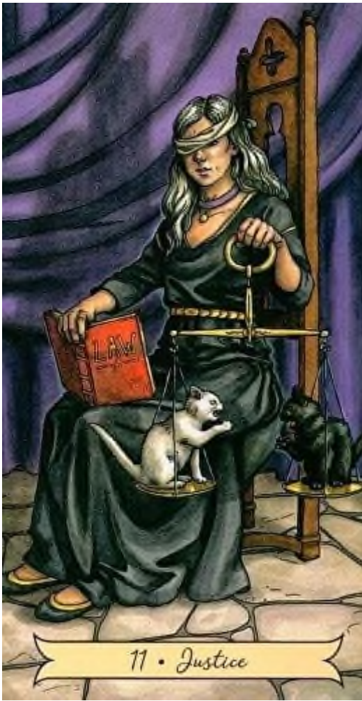
11 • Justice