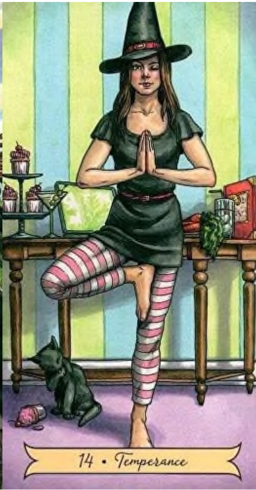
14 • Temperance