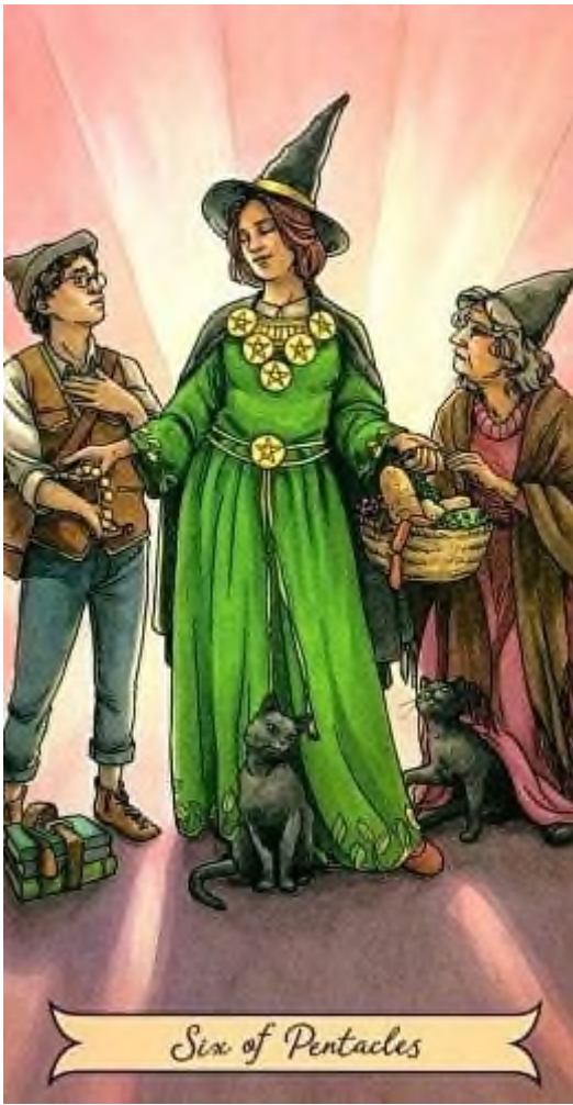
Six of Pentacles