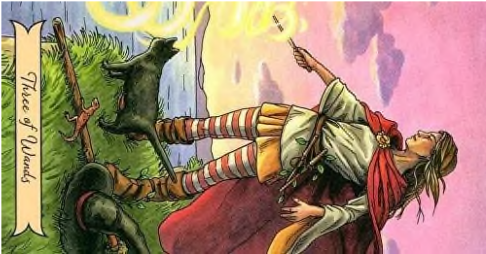
Three of Wands