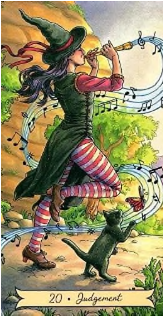
20 • Judgement