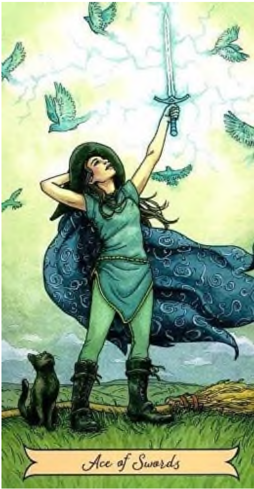
Ace of Swords