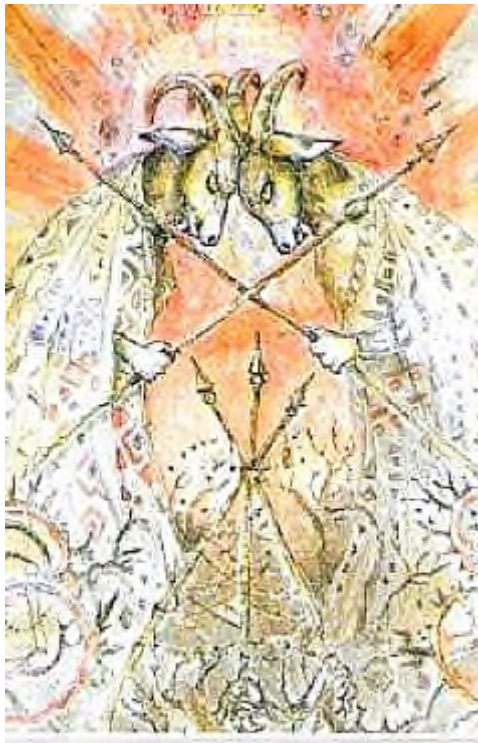
FIVE of WANDS