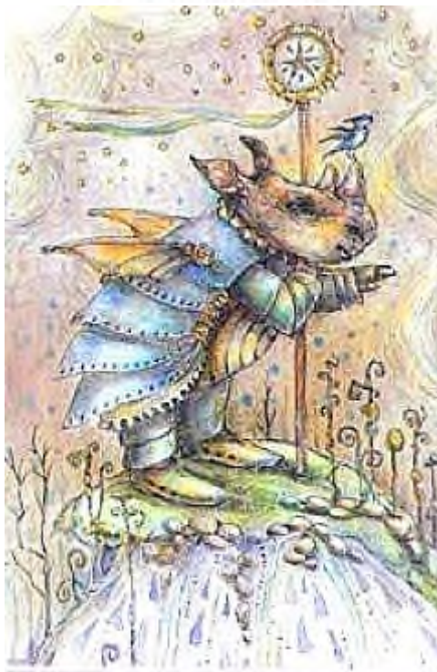
KNIGHT of PENTACLES