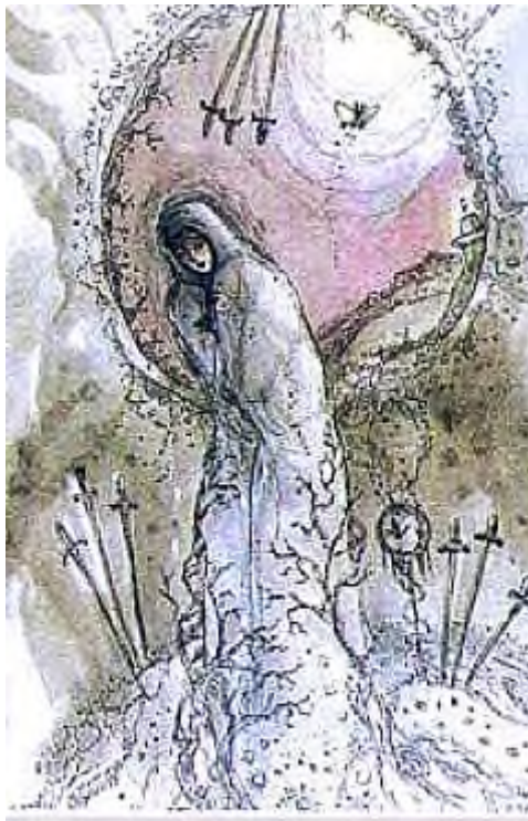
NINE of SWORDS