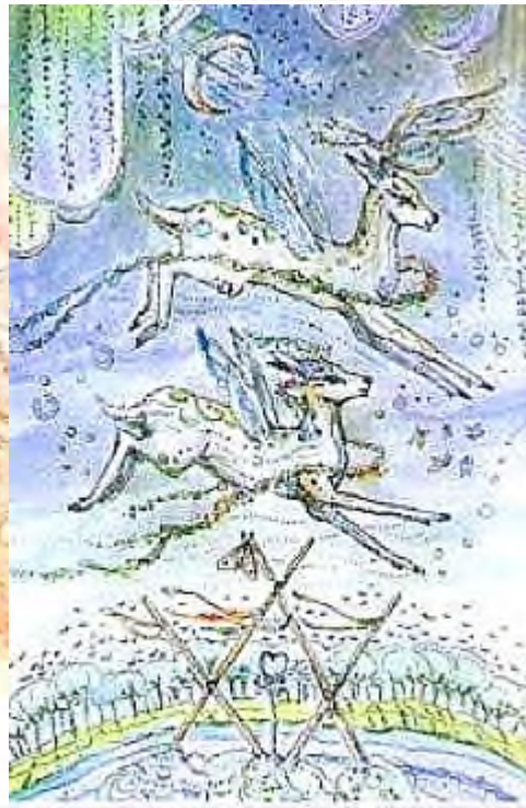
FOUR of WANDS