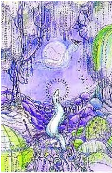
THREE of WANDS