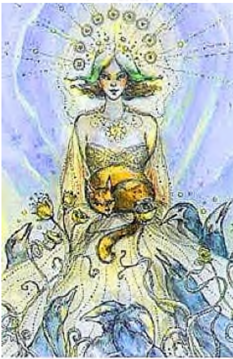
NINE of PENTACLES