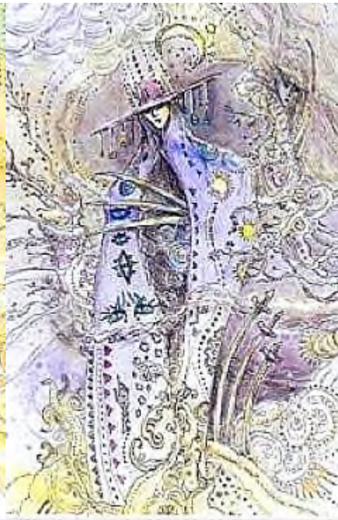
SEVEN of SWORDS