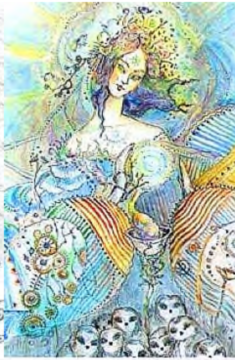
QUEEN of CUPS