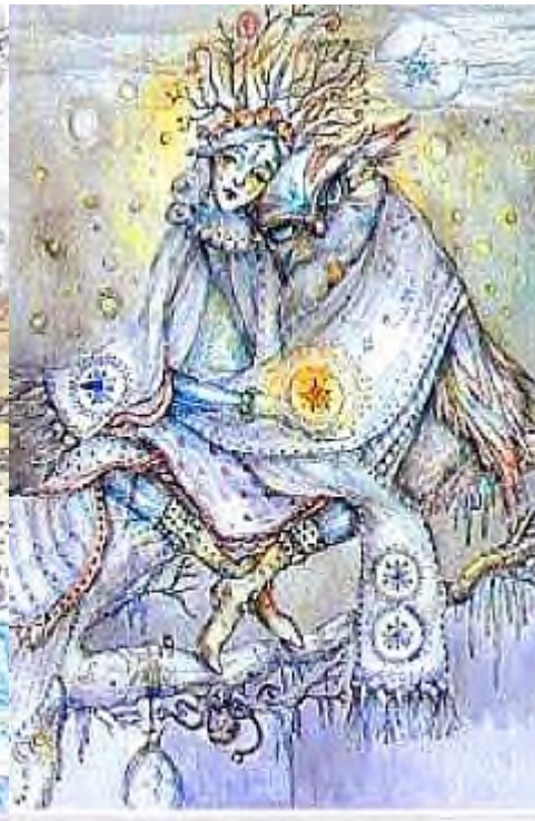
FIVE of PENTACLES