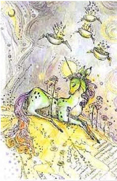
FOUR of CUPS