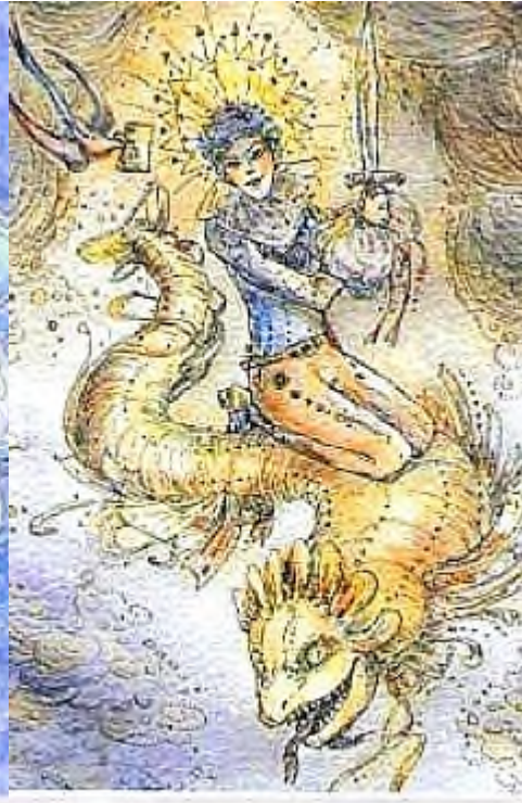
KNIGHT of SWORDS