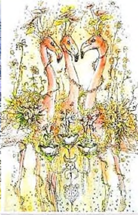
THREE of CUPS