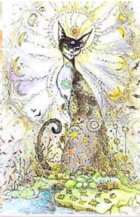
XX • AWAKENING