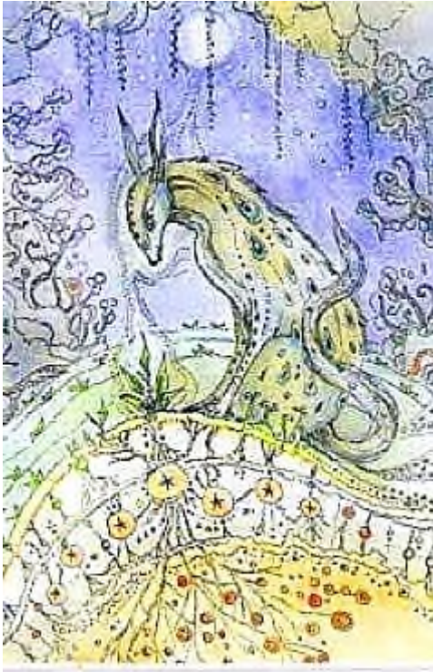
SEVEN of PENTACLES