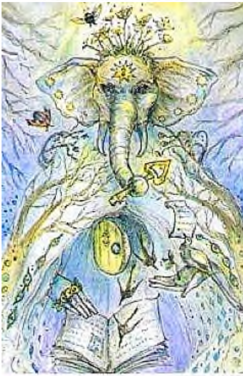
V • THE MENTOR