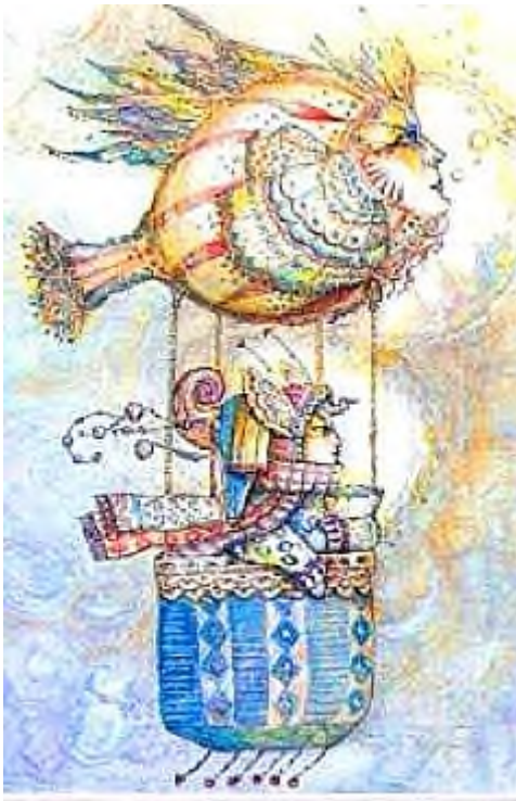
KNIGHT of CUPS