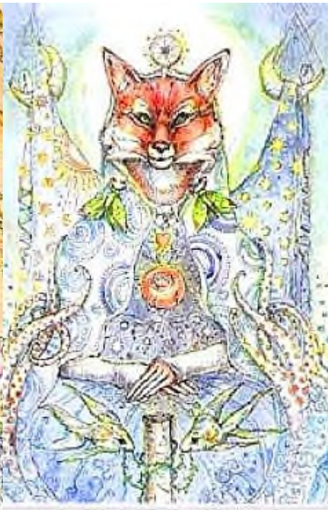
II • THE HIGH PRIESTESS