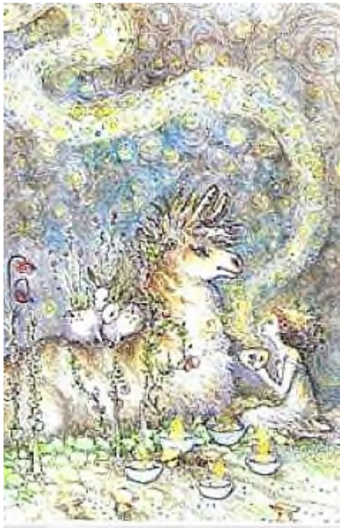
SIX of CUPS