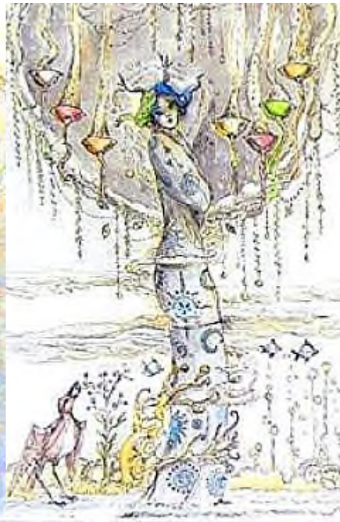
SEVEN of CUPS