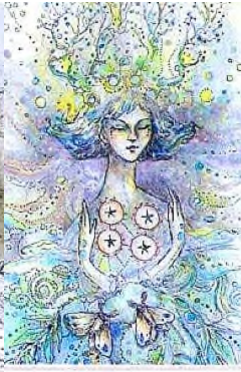
FOUR of PENTACLES