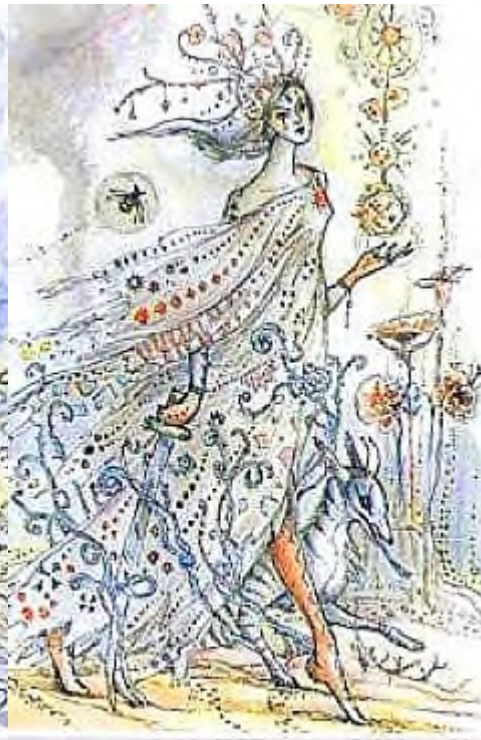
QUEEN of SWORDS