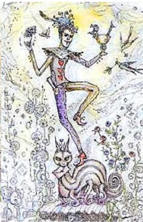
PAGE of CUPS