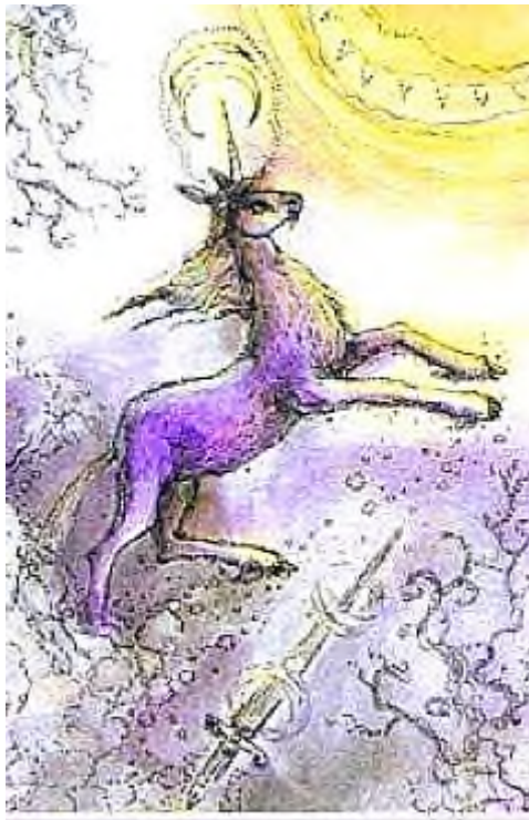
ACE of SWORDS