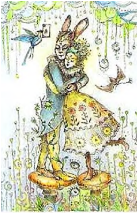
VI • LOVE