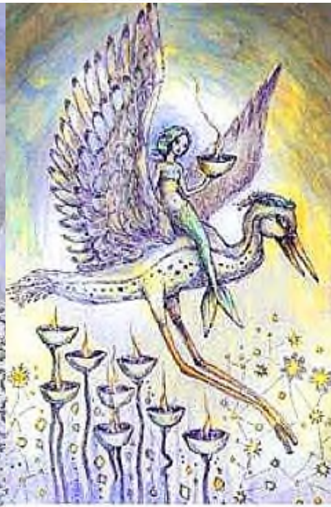
NINE of CUPS