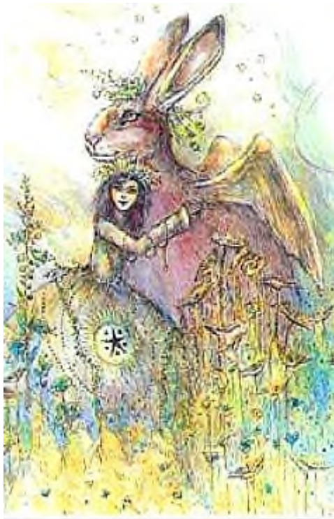
QUEEN of PENTACLES