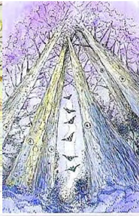
SIX of PENTACLES