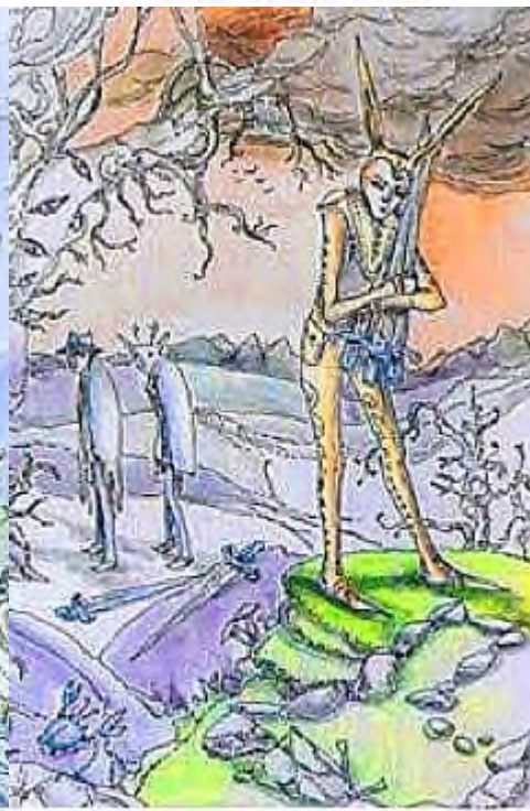
FIVE of SWORDS