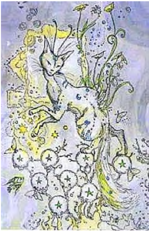
EIGHT of PENTACLES