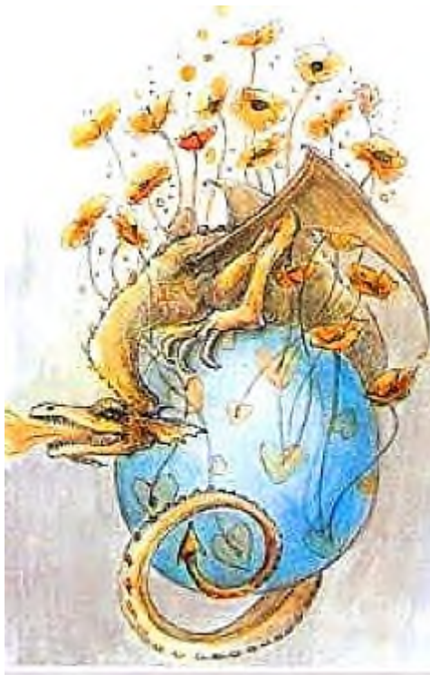
XXI • THE WORLD