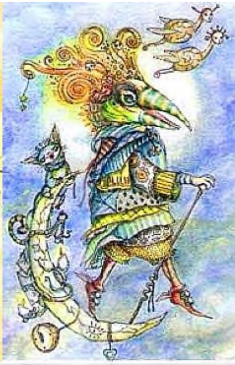
0 • THE FOOL