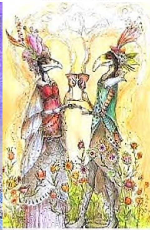
TWO of CUPS