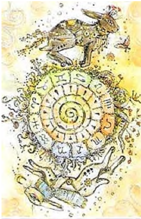
X • THE WHEEL OF LIFE