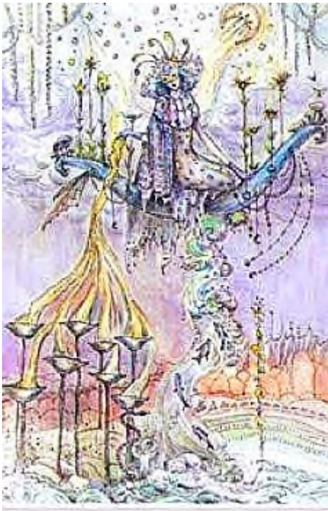
EIGHT of CUPS