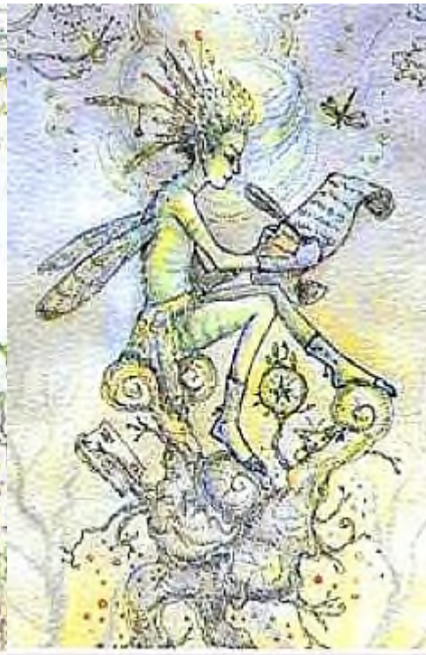
PAGE of PENTACLES