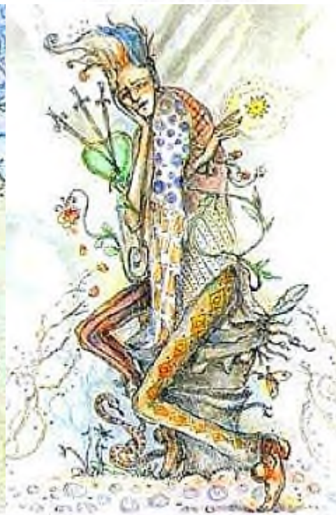
THREE of SWORDS