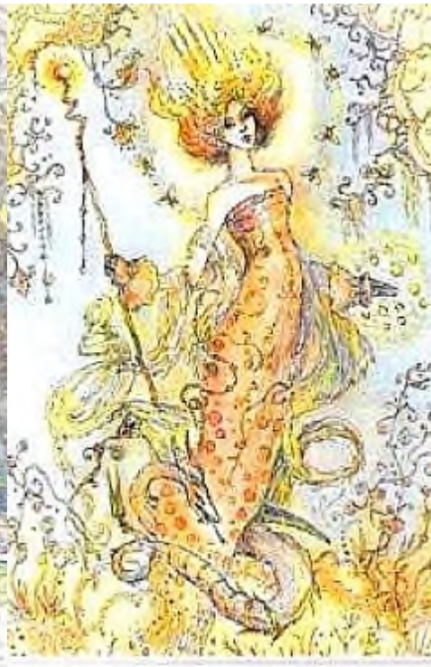
QUEEN of WANDS