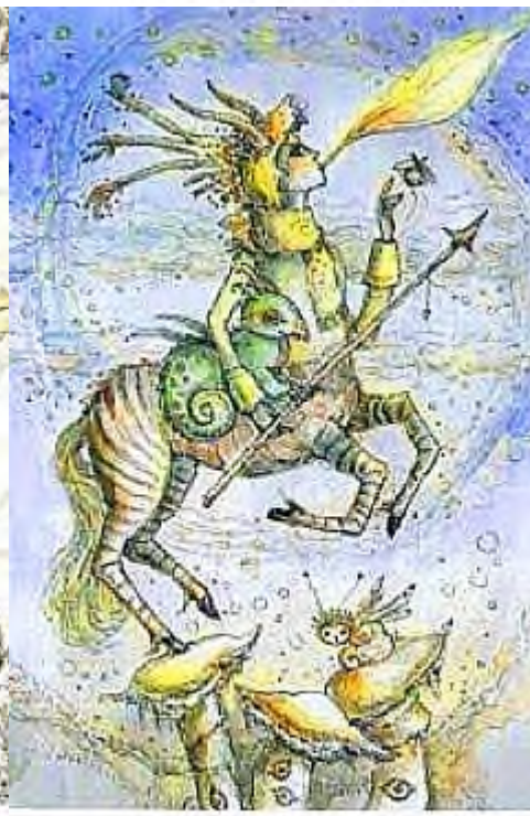
KNIGHT of WANDS