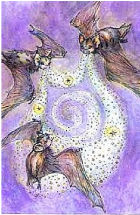
THREE of PENTACLES