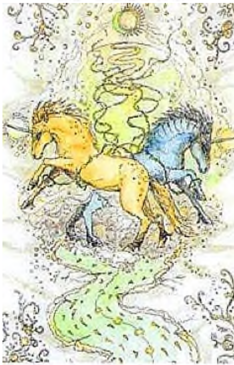
VII • THE CHARIOT