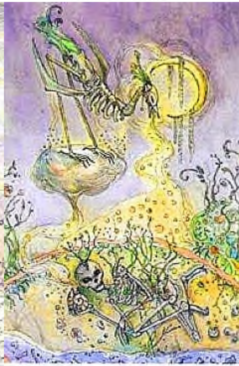
XIII • DEATH