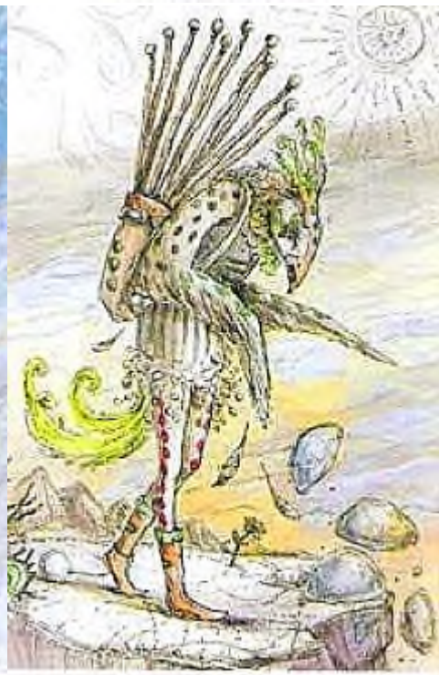
TEN of WANDS