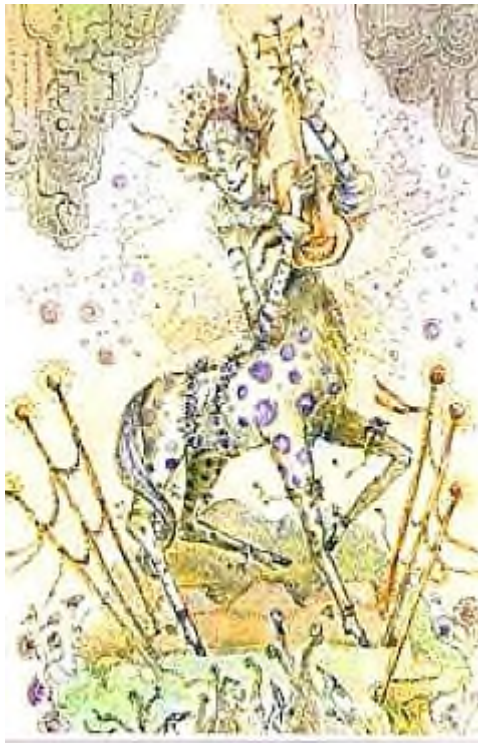
SIX of WANDS