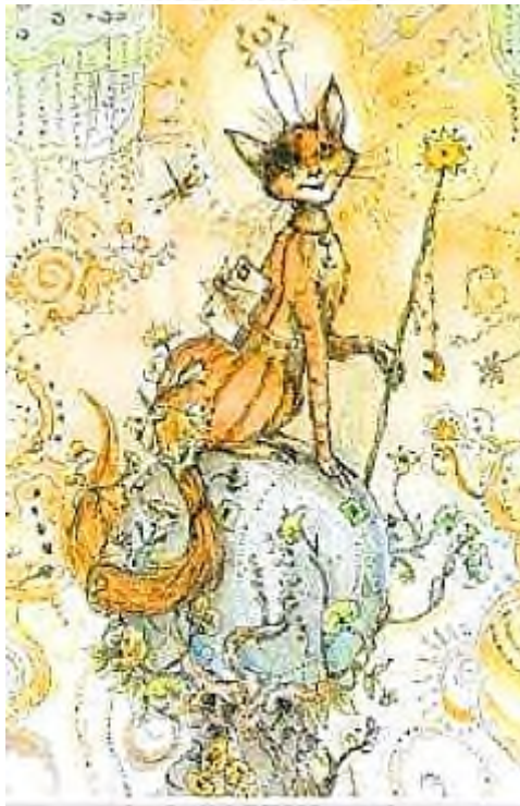
PAGE of WANDS