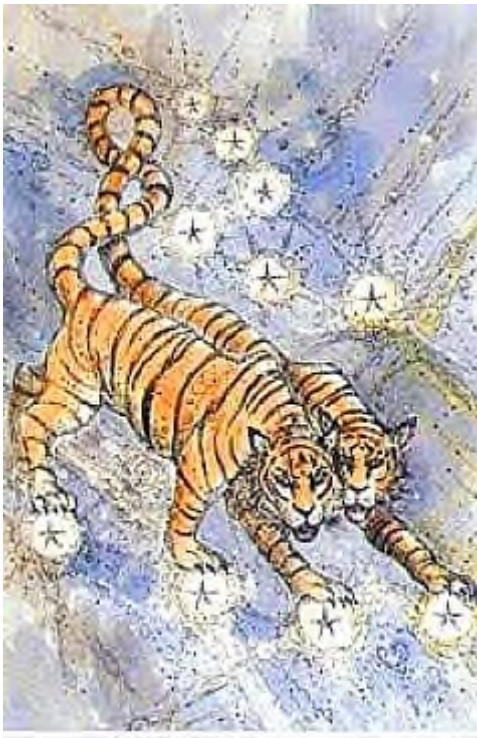
TEN of PENTACLES