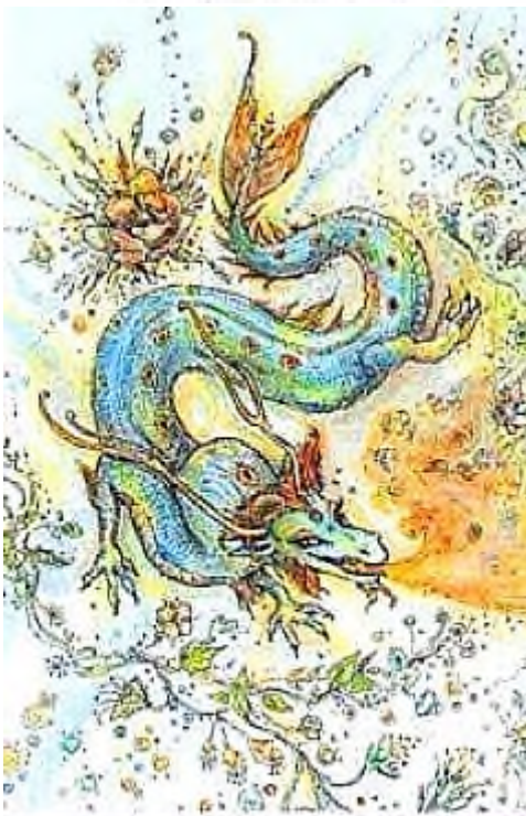
VIII • STRENGTH