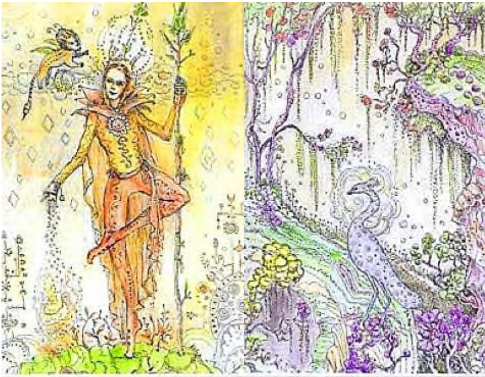
KING of WANDS