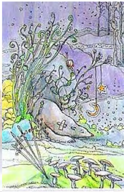
FOUR of SWORDS