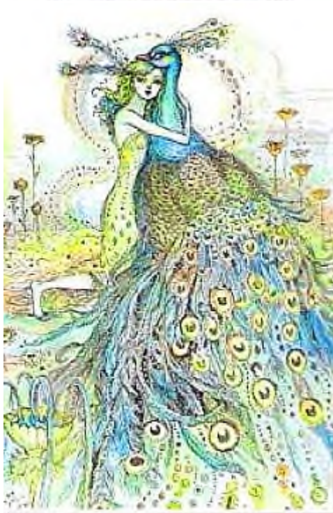
ACE of CUPS