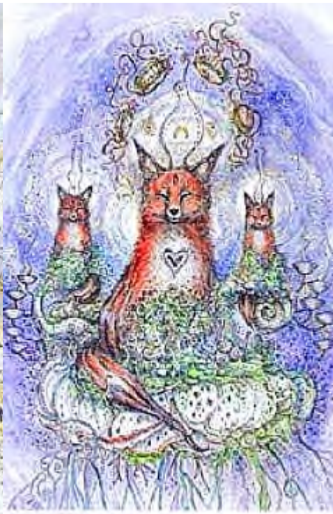
TEN of CUPS