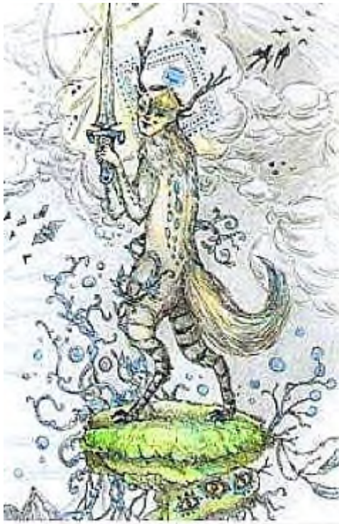
PAGE of SWORDS