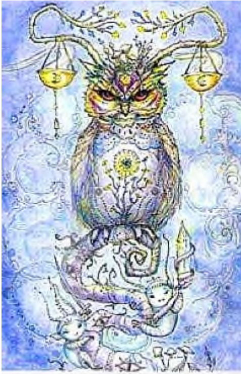
XI • JUSTICE