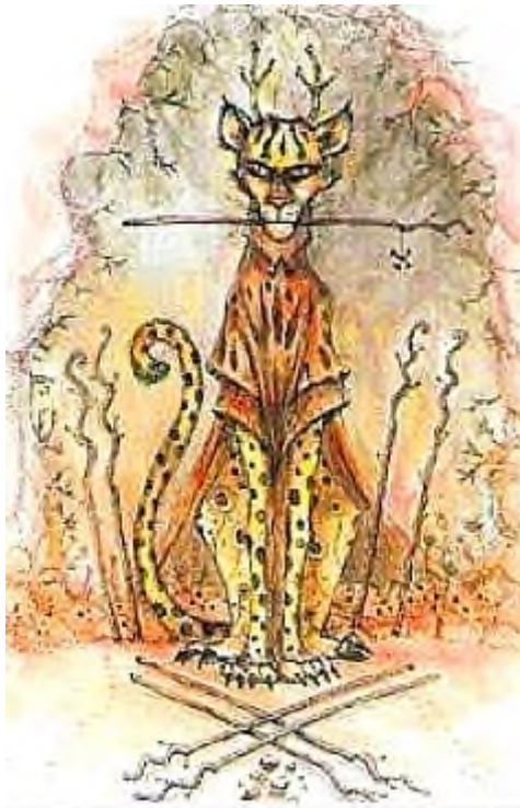
NINE of WANDS