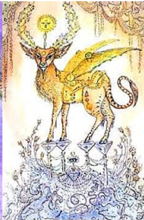
IV • THE EMPEROR