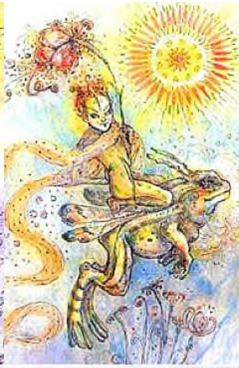
XIX • THE SUN