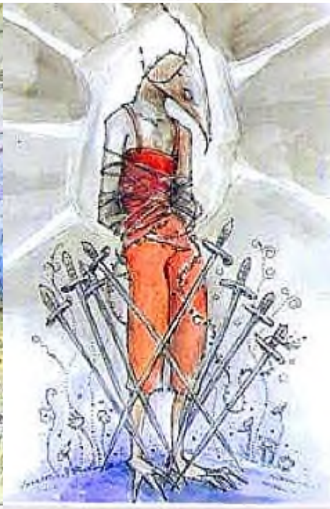
EIGHT of SWORDS