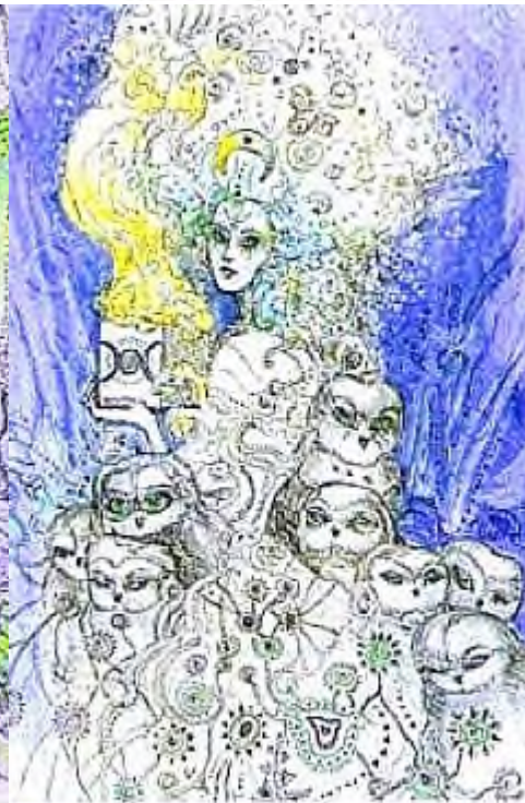
XVIII • THE MOON