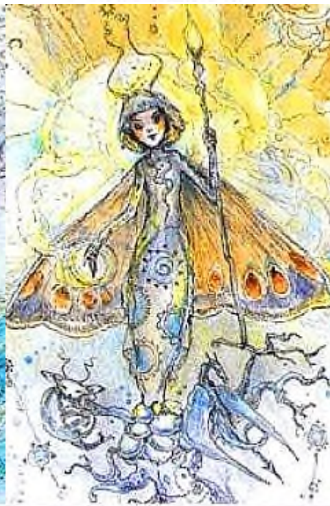
ACE of WANDS