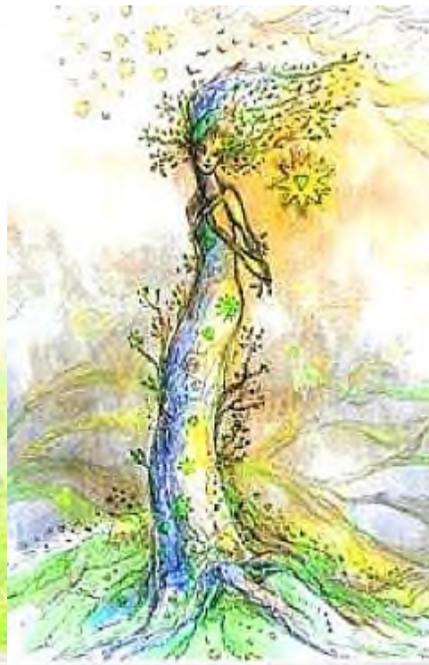
XVII • THE STAR