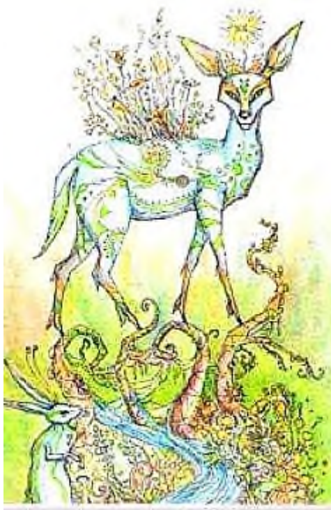
III • THE EMPRESS