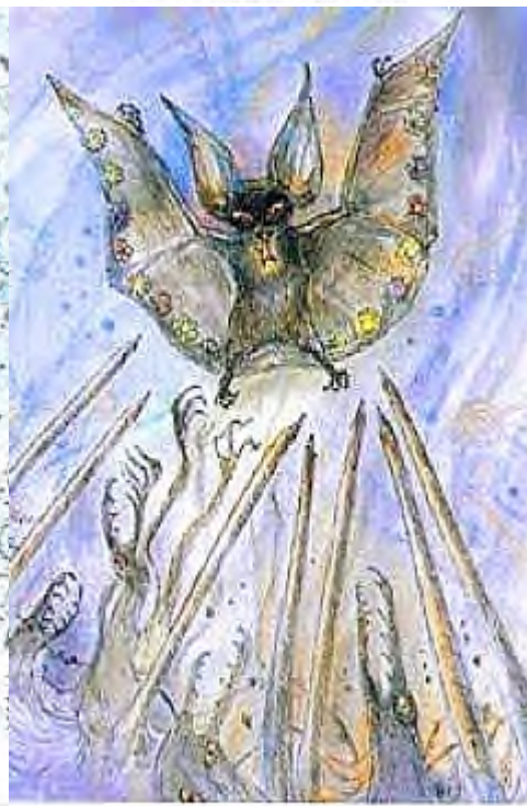
SEVEN of WANDS