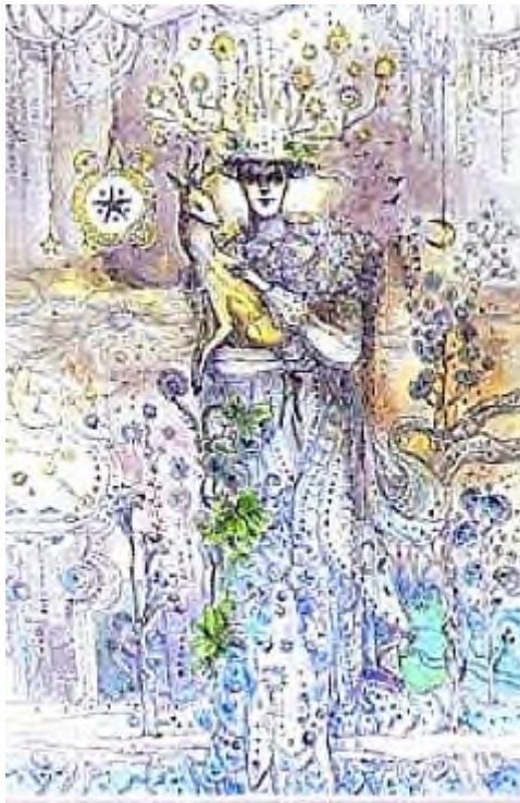
KING of PENTACLES