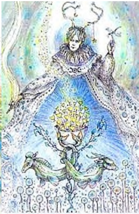
KING of CUPS