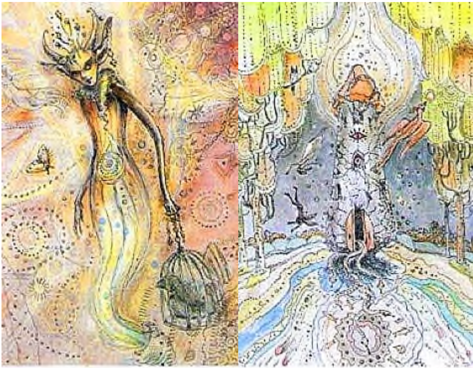
XV • THE DJINN