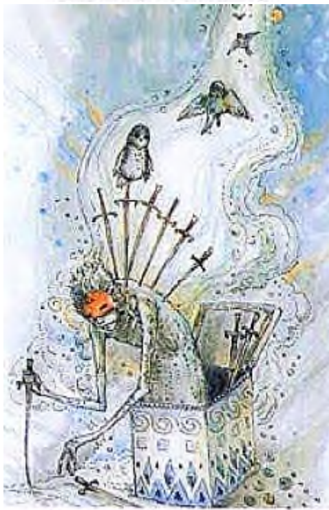
TEN of SWORDS