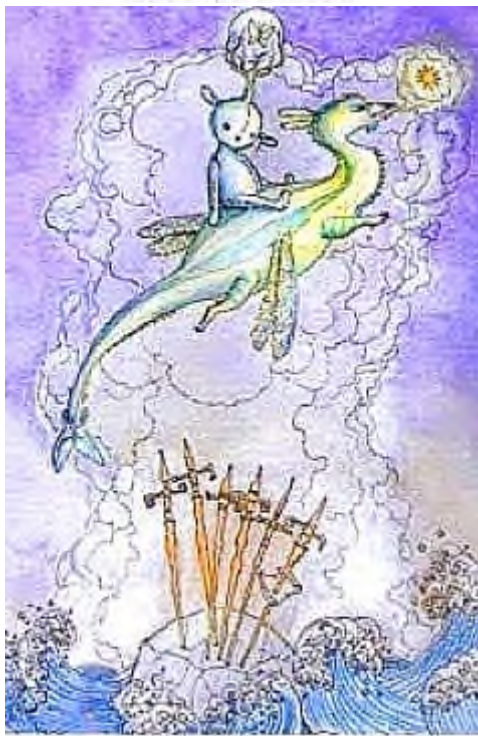
SIX of SWORDS