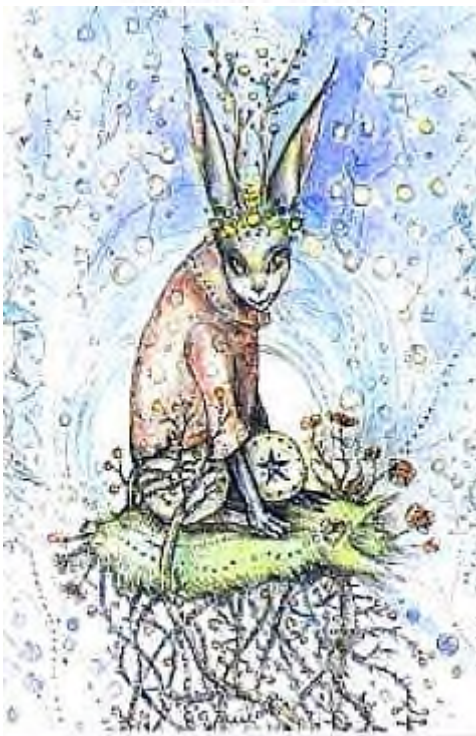
ACE of PENTACLES