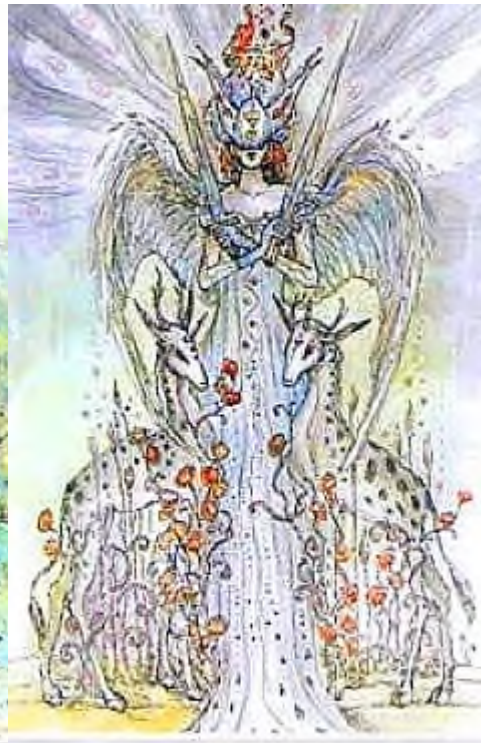
TWO of SWORDS