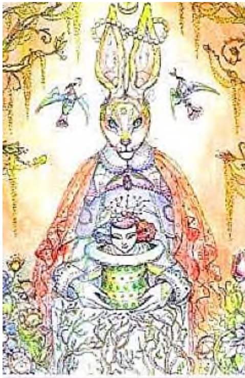
I • THE MAGICIAN