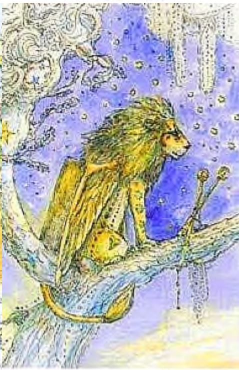
TWO of WANDS