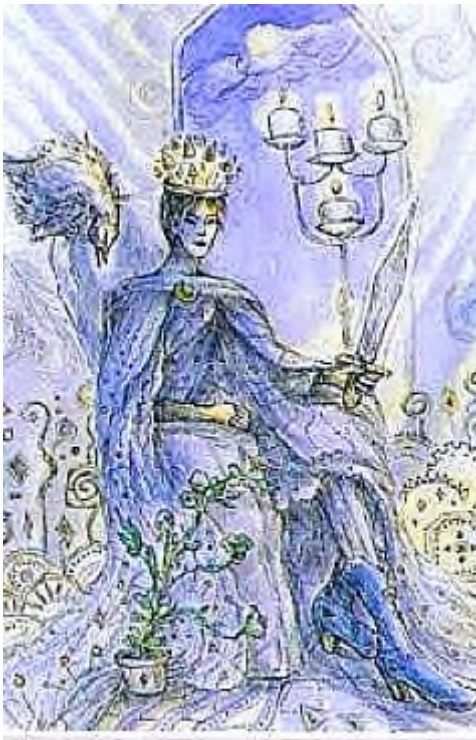
KING of SWORDS