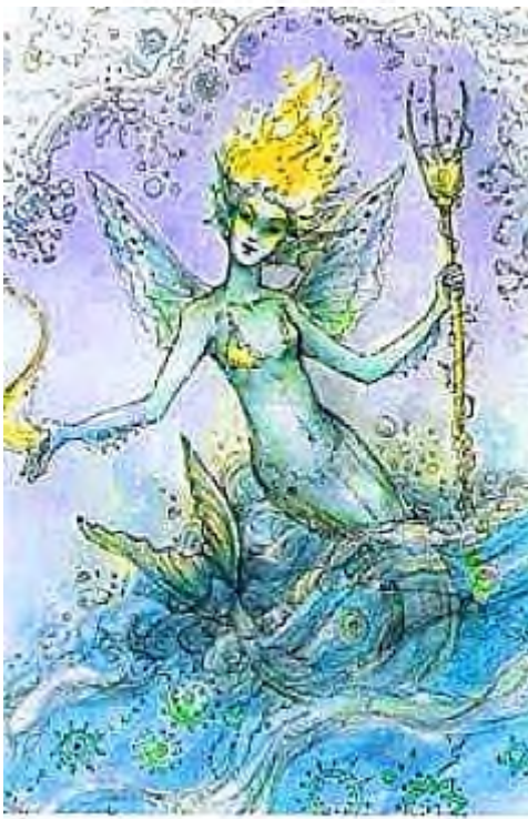
XIV • TEMPERANCE