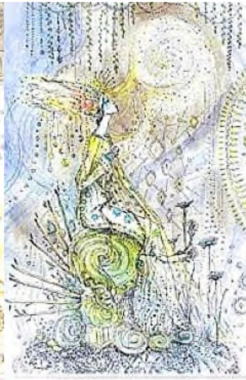
EIGHT of WANDS