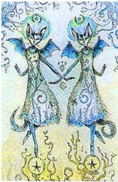
TWO of PENTACLES