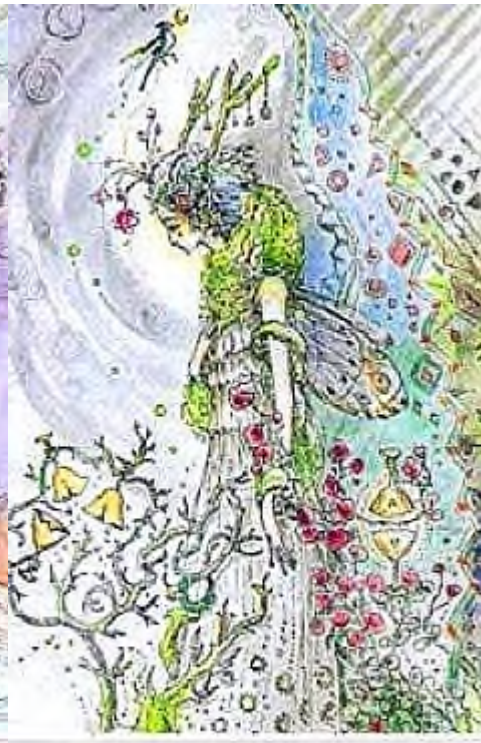
FIVE of CUPS